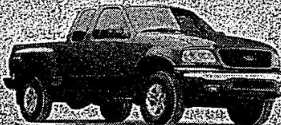
2003 Ford F-150