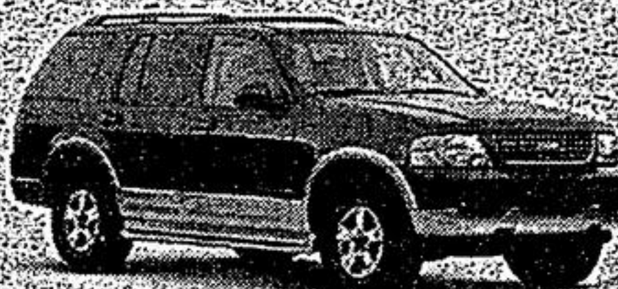
2003 Ford Explorer