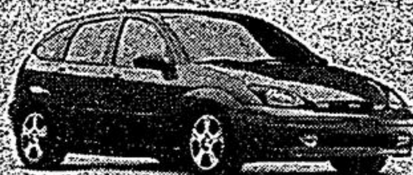
2003 Ford Focus

Get savings of up to $6,000 on Cash Purchase Savings range from $1,000 to $6,000 on new in-stock 2003 Ford Focus, Mustang, Taurus, Marauder, Grand Marquis, Ranger, Explorer, Escape, Windstar, Expedition, Excursion, F-150 including SuperCrew.