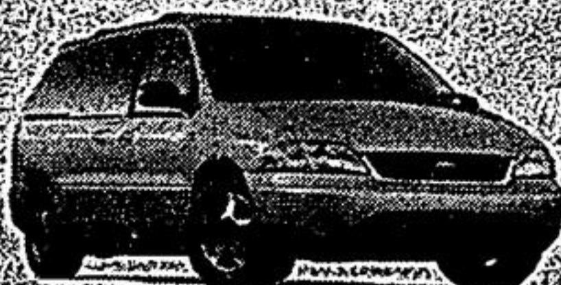
2003 Ford Windstar