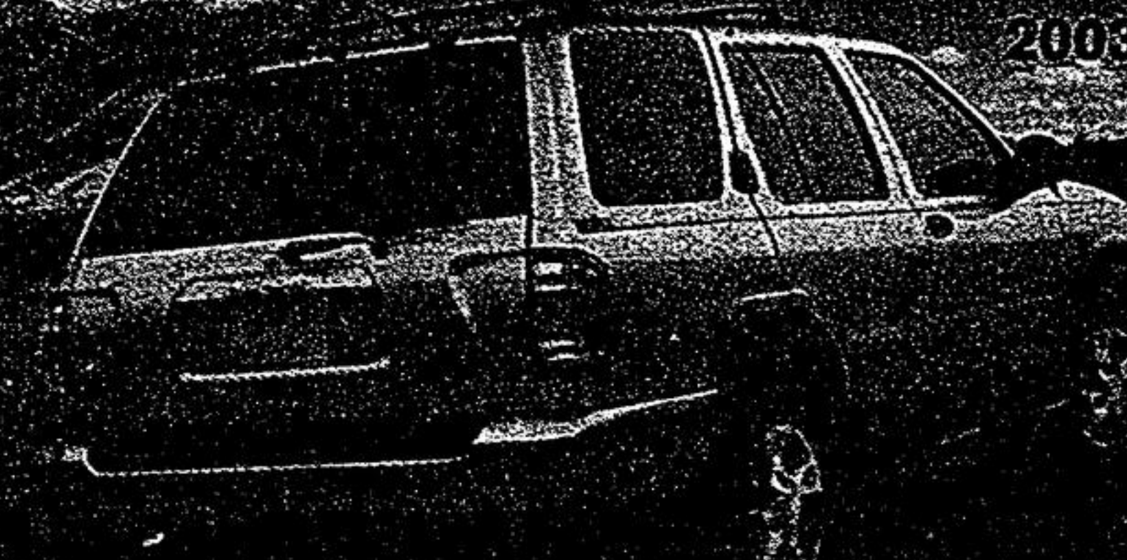
2003 PATHFINDER Chilkoot Edition