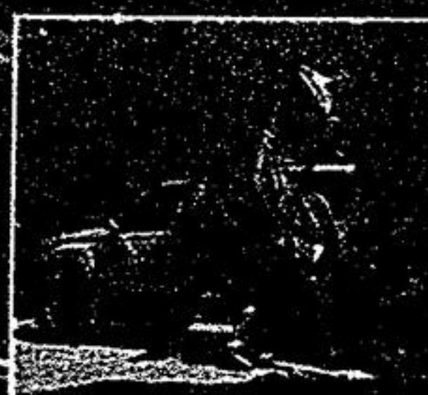
2003 XTERRA Xterra XE