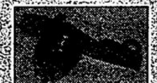
WATER SAVING TOILET FLAPPER

York Region wants to help you SAVE water and SAVE $$$ by installing these WATER SAVING devices in your home