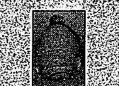
LOW FLOW SHOWERHEAD