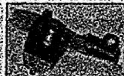
WATER SAVING TOILET FLAPPER

York Region wants to help you SAVE water and SAVE $$$ by installing these WATER SAVING devices in your home.