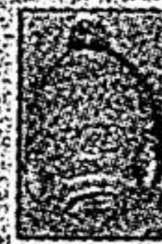
LOW FLOW SHOWERHEAD