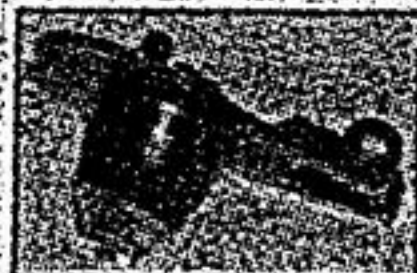
WATER SAVING TOILET FLAPPER

York Region wants to install WATER SAVING devices in your home.