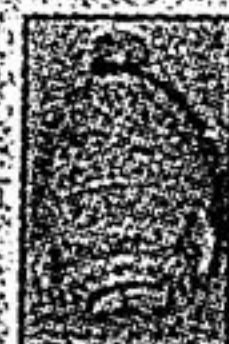
LOW FLOW SHOWERHEAD