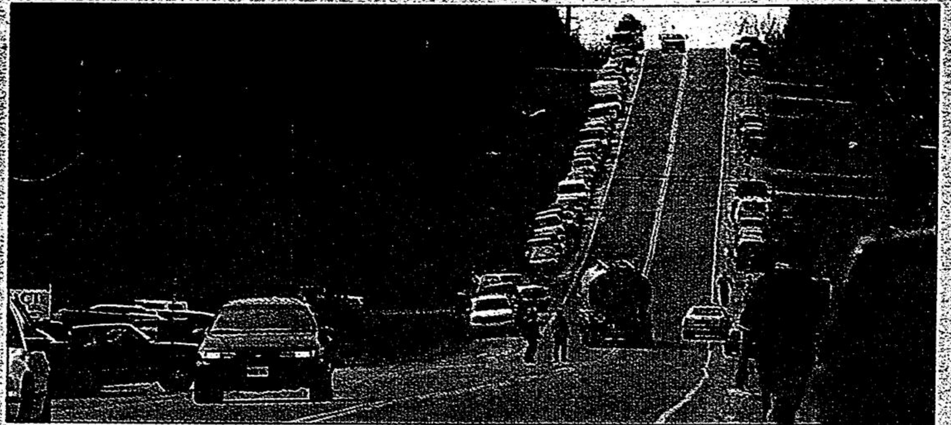
A tanker truck avoids a car trying to find a parking spot on Tuesday morning outside Impact Auto on Hwy. 48 north of Ballantrae. Neighbours have complained about illegally parked vehicles at auto auctions. Police towed 19 vehicles and ticketed 30 more Tuesday.