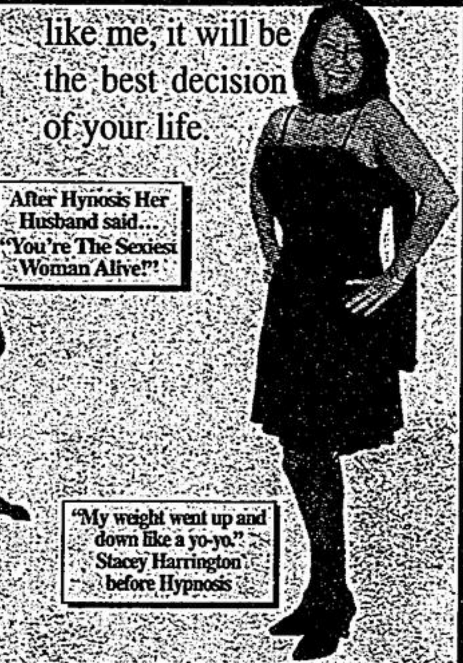
After Hypnosis Her Husband said... "You're The Sexiest Woman Alive!"

I dropped 49 lbs. in five short months. Being in hypnosis is serenity itself. I walk away from my sessions feeling refreshed, invigorated and in control of my life. When I'm full, I stop eating, I don't feel like I'm depriving myself.