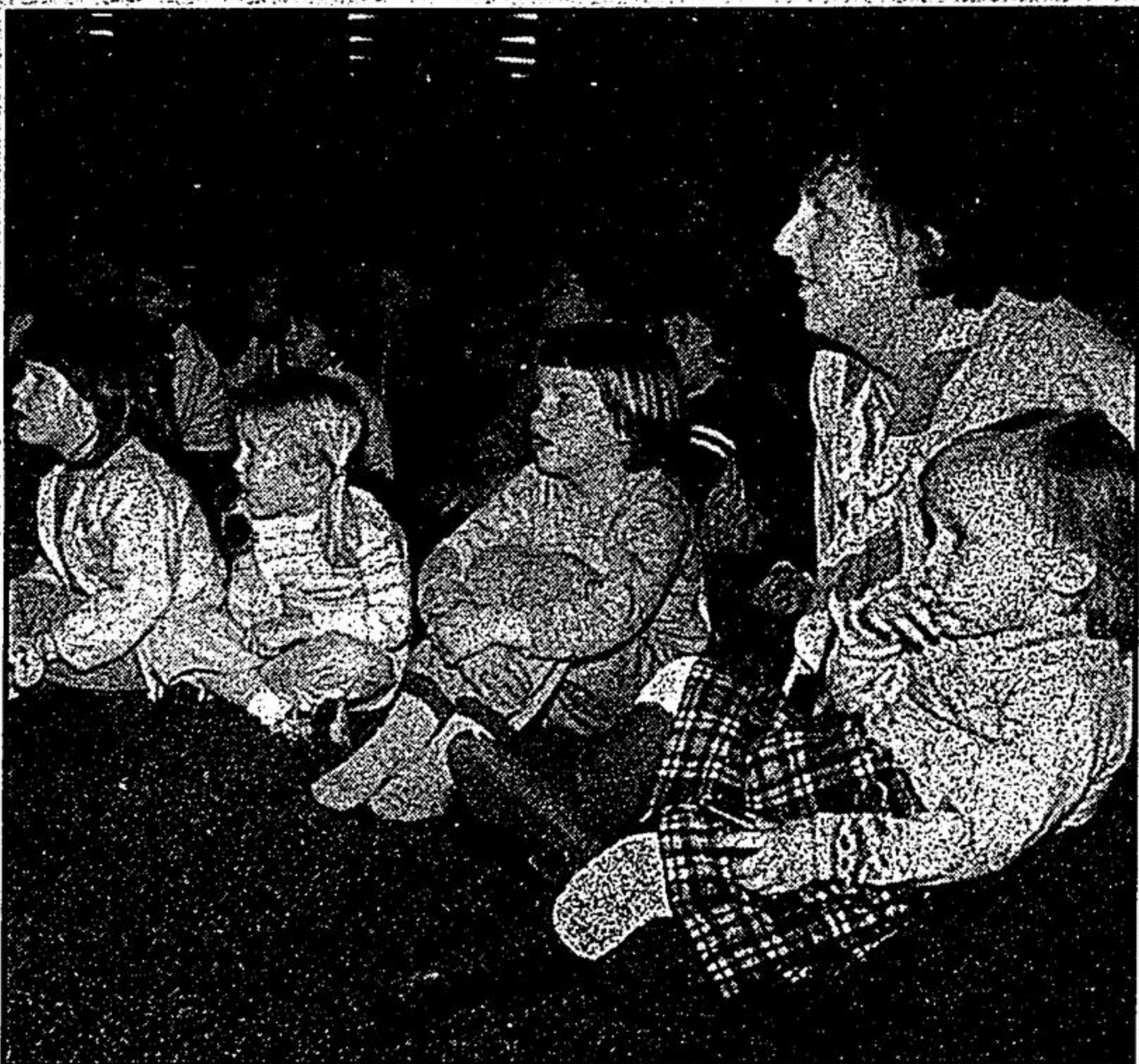
STOUFFVILLE TRADITION: March Break festivities at the Whitchurch-Stouffville Public Library are an annual rite of spring. Above, parents and kids enjoy a performance at the library in 1983. Call the library at 905-640-2395 for details on this week's events.

STOUFFVILLE 1877-1977 HISTORY BOOK PHOTO