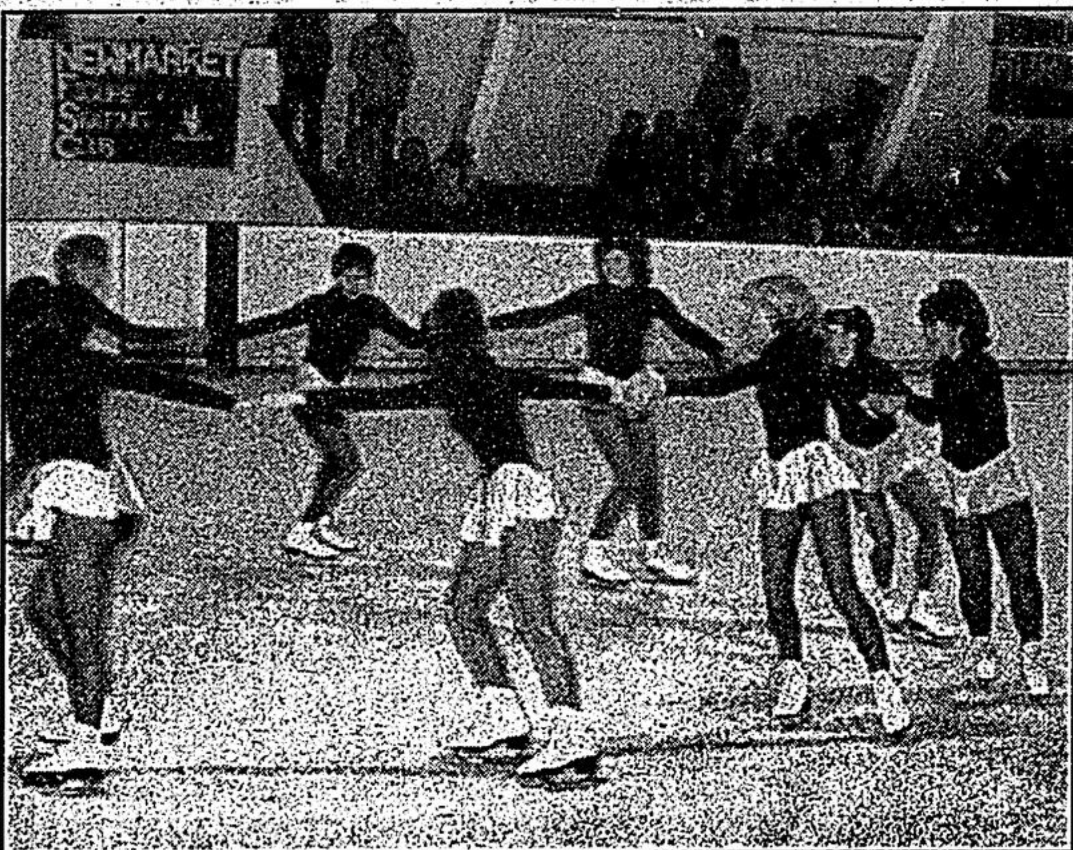
THE OLD RINK: Precision skaters from the Stouffville Figure Skating Club compete at the old Stouffville Arena — on Park Drive where the skateboard park now stands — in 1983.