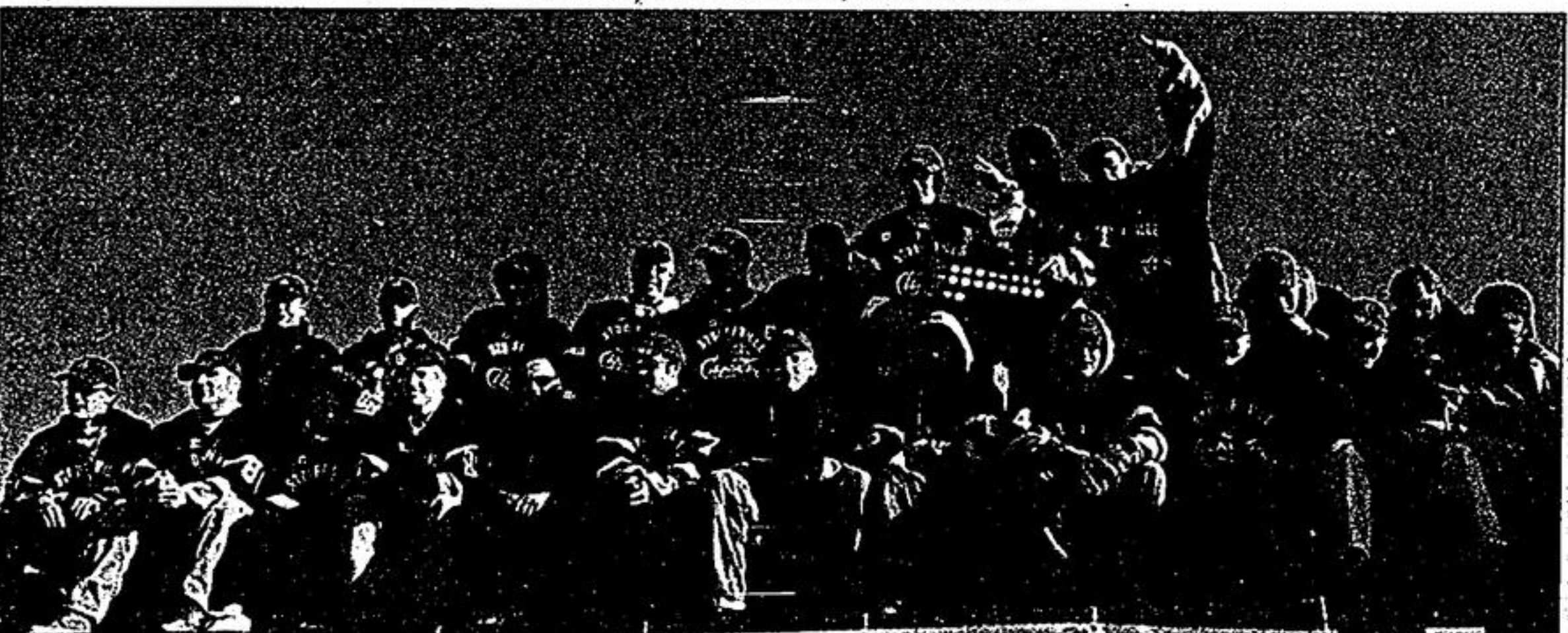
Members of the Stouffville juvenile Clippers were honoured for winning the Ontario Minor Hockey Association A level title with a parade through Stouffville in early April.