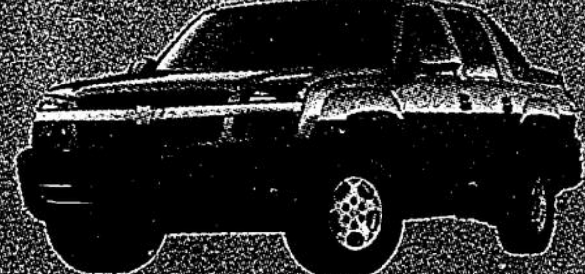
2003 Chevy Avalanche

★★★★★ FIVE STAR SAFETY RATING Chevrolet Impala has earned a 5-Star front crash test rating.