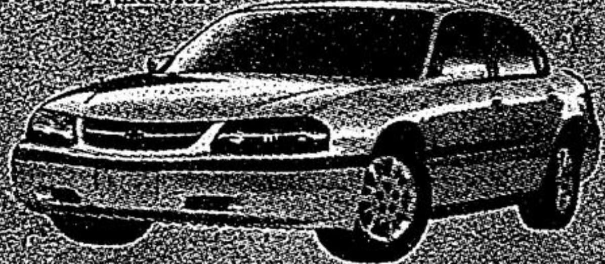
2003 Chevrolet Impala

2002 Chevrolet Malibu Ranked Best Entry Midsize Car in Initial Quality in the U.S. 3.1L 170-HP V6 Engine • 4-Speed Automatic Air Conditioning • Power Locks/Windows/Mirrors • Remote Keyless Entry • Cruise Control • CD Stereo And More