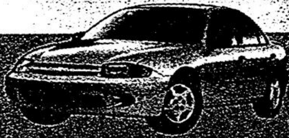
2003 Chevrolet Cavalier V6 Sedan