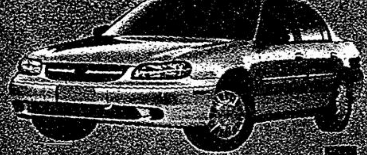
2003 Chevrolet Malibu V6

5-Year/100,000 Km GM Powertrain Warranty with 50 Deniable NEW 2.2L 140-HP ECOTEC Engine • NEW Redesigned Interior/Interior • IMPROVED Ride and Handling NEW 60/40 Split-Folding Rear Seat