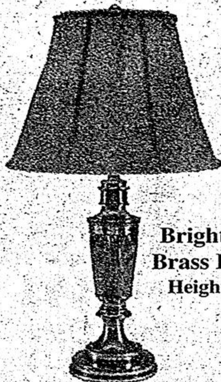
Bright Old Brass Finish Height 29"

CHOOSE FROM ONE OF ONTARIO'S LARGEST SELECTION