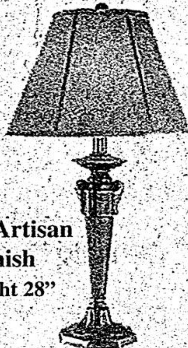
Aged Artisan Finish Height 28"

SERVING FINE HOMES AND BUILDERS SINCE 1971