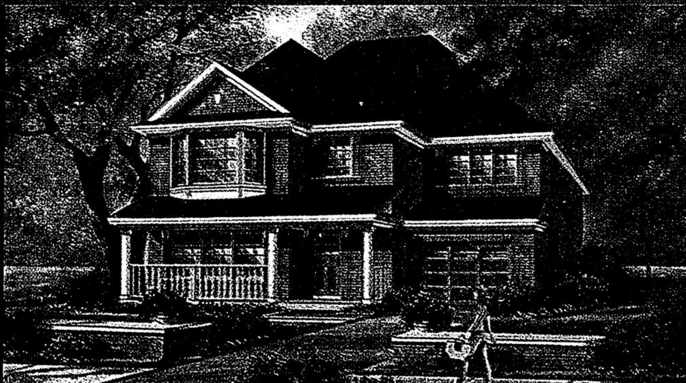
Golden Delicious from $284,990, elevation B shown.