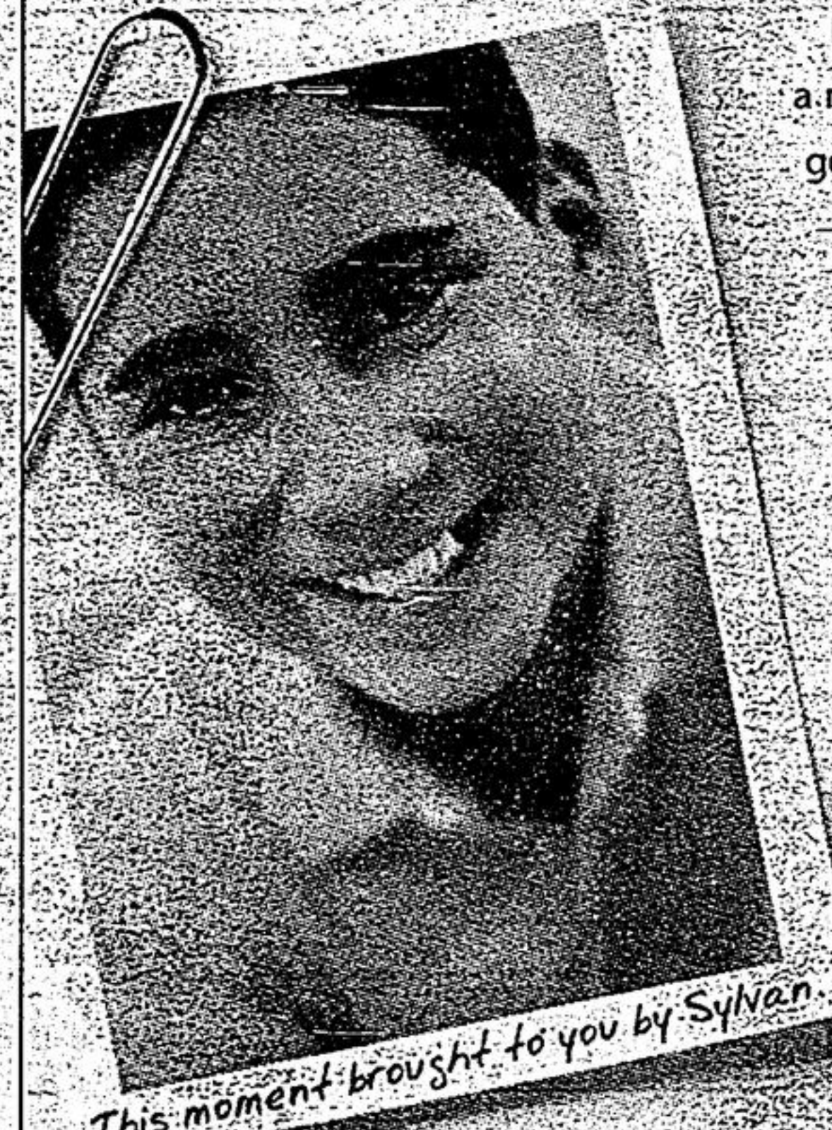
This moment brought to you by Sylvan.

For more than 20 years, Sylvan has helped over a million children develop a love of learning. We get results through a proven process that works — the Sylvan Advantage™.