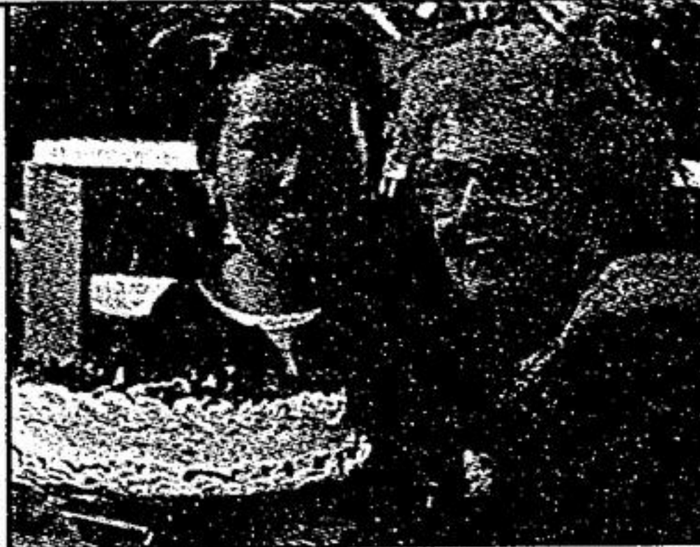
"Affordable Luxury" at