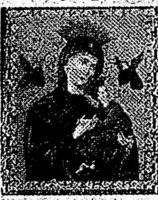
Our Mother of Perpetual Help

Holy Spirit Thou make me see everything and show me the way to reach my ideal. You who give the divine gift to forgive and forget the wrong that is done to me and who are in all instances of my life with me. I, in this short dialogue, want to thank You for everything and confirm once more that I never want to be separated from You no matter how great the material desire may be. I want to be with You and my loved ones in Your perpetual glory. Amen. Person must pray this 3 consecutive days without stating one's wish. After the 3rd day your wish will be granted no matter how difficult it may be. Promise to publish this as soon as your favor has been granted.