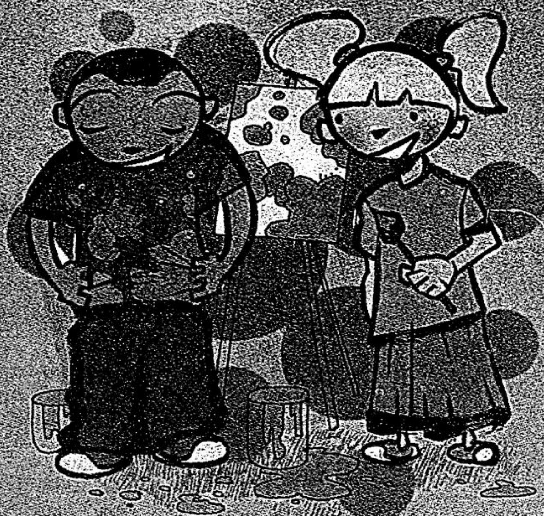
The Art Zone. One of the many Play Zones that you will find at a Sunlight PlayDay.

Sunlight Toronto PlayDay September 7, 2002. 10:30 - 5:00 Milliken Mills Community Centre