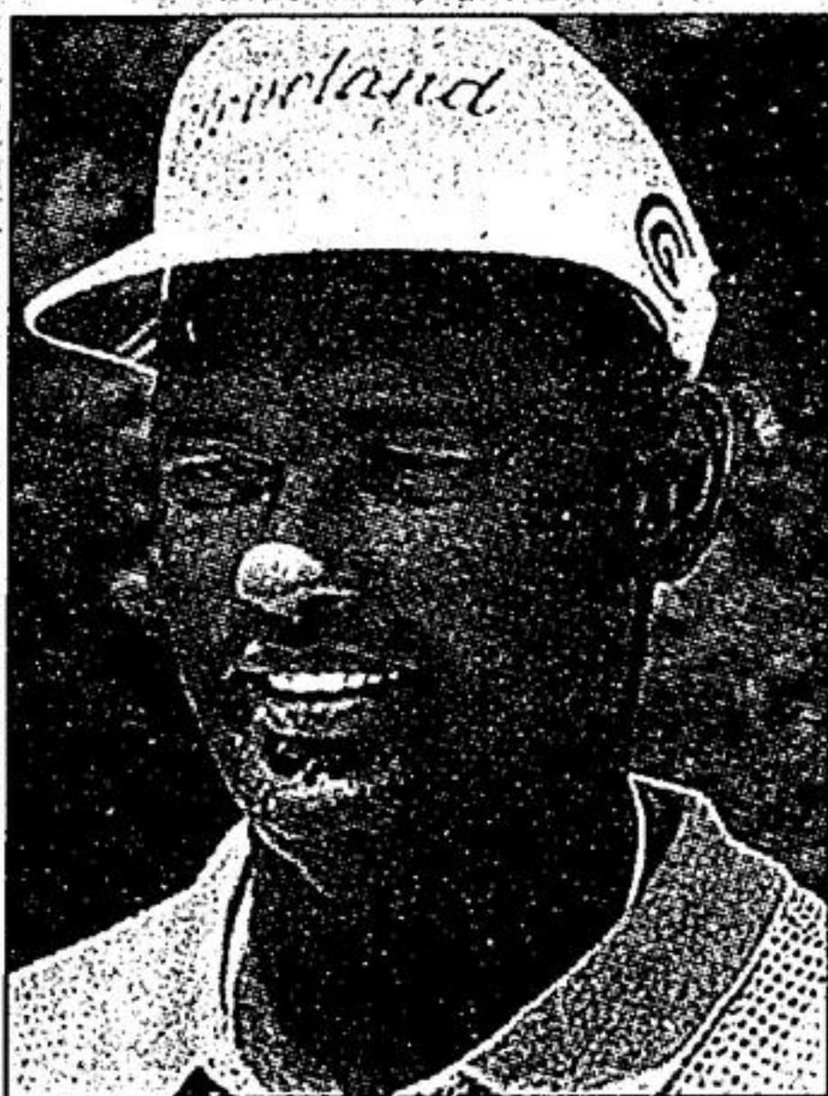
VIJAY SINGH: Captured last year's Telus Skins Game title at Angus Glen Golf Club's north course.

More competitors are expected to be announced by the Royal Canadian Golf Association in the near future on a weekly or bi-weekly basis.