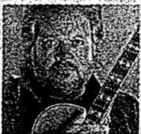
RANDY BACHMAN Mar. 31 & Apr. 1, 2003