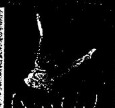
THE NEW SHANGHAI CIRCUS Jan. 2 & 3, 2003