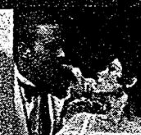
HAY FEVER Jan. 22 - 25, 2003