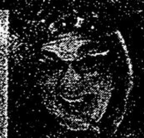
IVANKA'S PERFECT CHRISTMAS Nov. 27 & 28, 2002