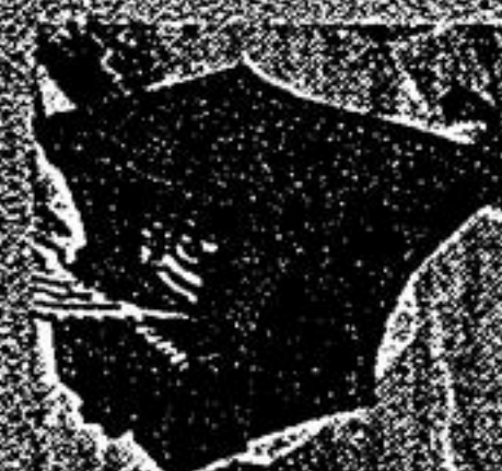
AN OLD FASHIONED SING-ALONG Mar. 17, 2003