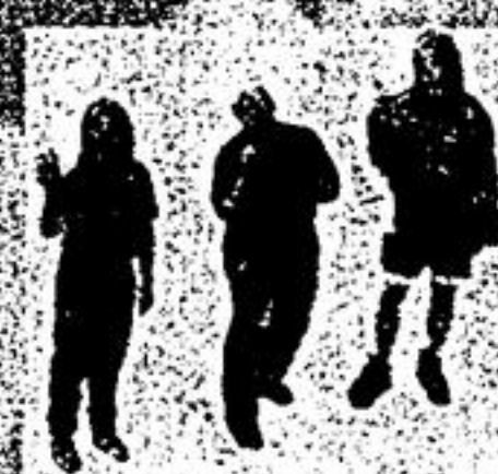
LIGHTHOUSE Apr. 14, 2003