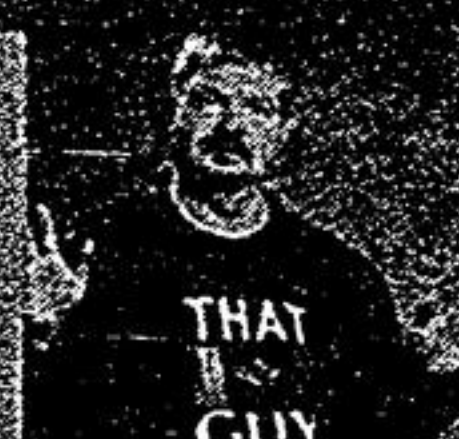
THAT CANADIAN GUY & FRIENDS Feb. 7 & 8, 2003