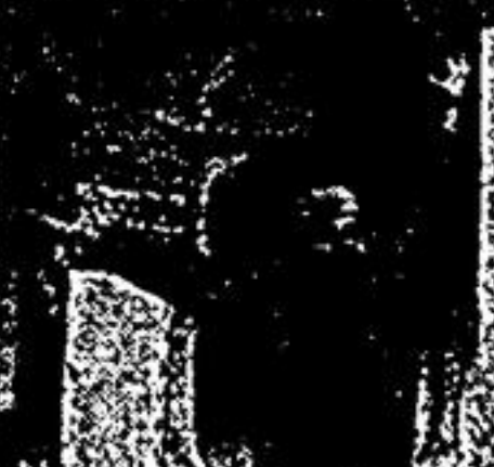
WINNIE THE POOH Oct. 27, 2002