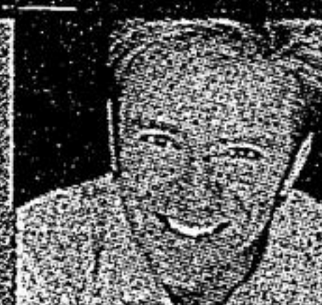
THE PIANO MEN: MUSIC OF BILLY JOEL & ELTON JOHN Nov. 26, 2002