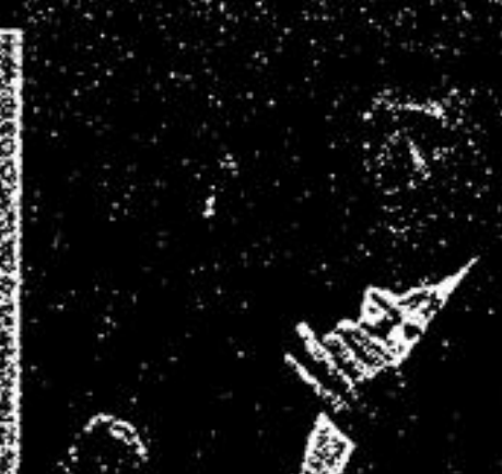
LAST NIGHT AT THE PROMS Nov. 18, 2002