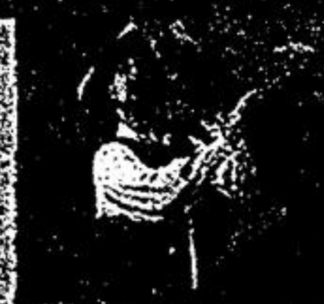
ROBINSON CRUSOE Nov. 17, 2002