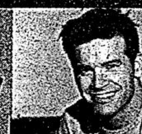
ROCH VOISINE Oct. 28, 2002