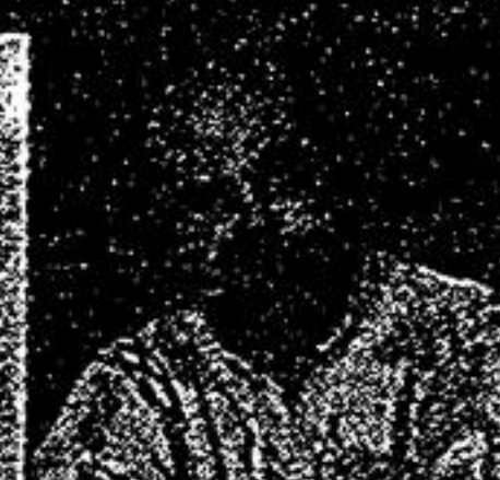
THE TRUTH ABOUT LOVE AND/OR MARRIAGE Apr. 9 - 12, 2003