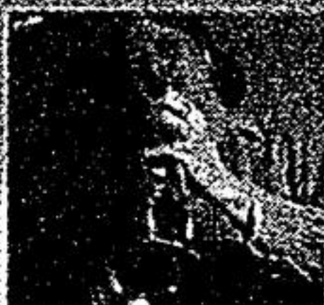
JEFF HEALEY'S JAZZ WIZARDS Jan. 16, 2003