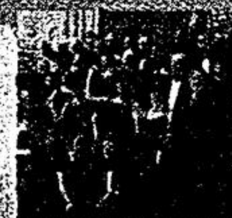
THE MESSIAH Dec. 13, 2002