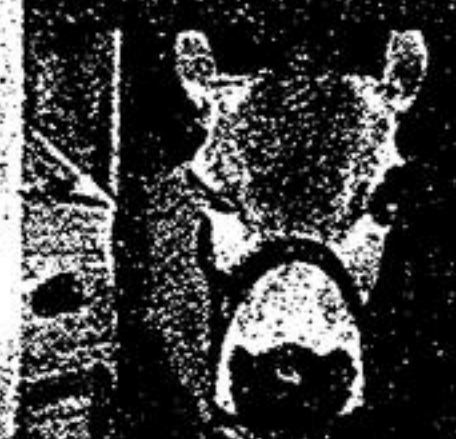
THE DRAWER BOY Oct. 30 - Nov. 2, 2002