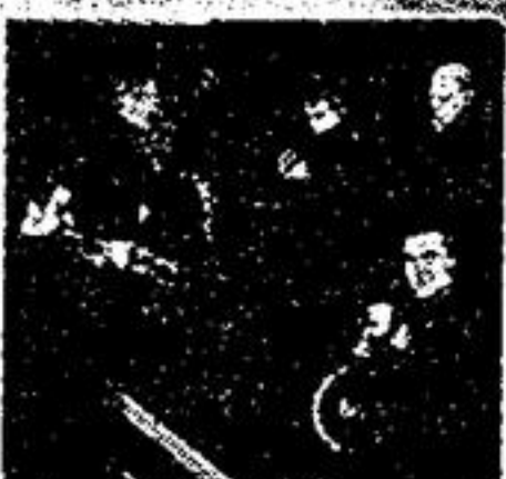
CANADIAN BRASS CHRISTMAS Dec. 1, 2002