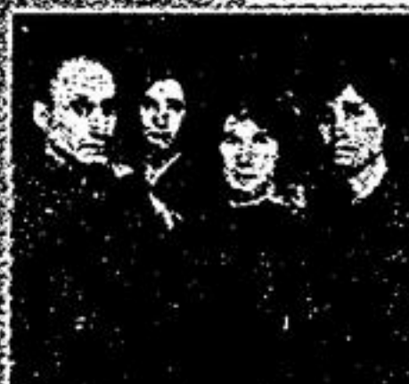
THE COWBOY JUNKIES Mar. 3, 2003