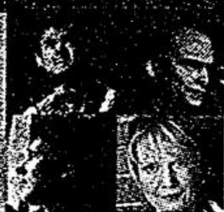
SOME GREAT SONGS AND A FEW OF MY OWN Nov. 3, 2002