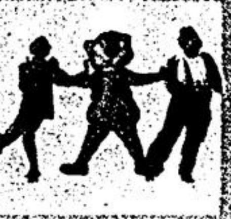
SHARON, BRAM & FRIENDS Feb. 2, 2003