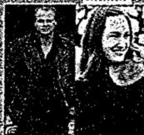
OH BROTHER, O CANADA Feb. 20, 2003