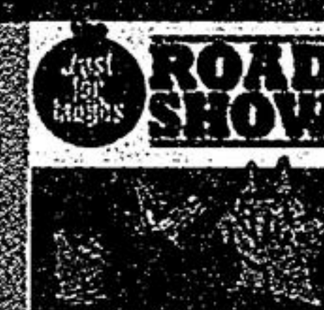
THE JUST FOR LAUGHS ROAD SHOW Apr. 4 & 5, 2003