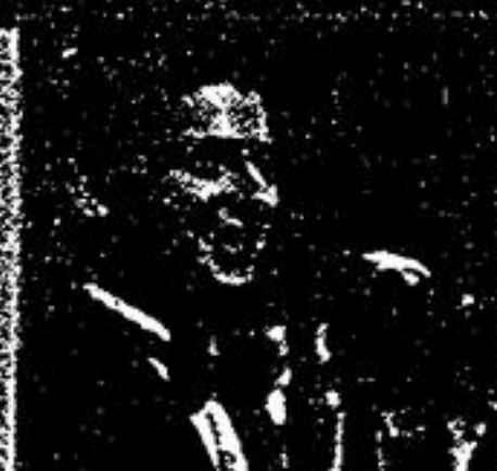
KINGS OF SWING Oct. 29, 2002