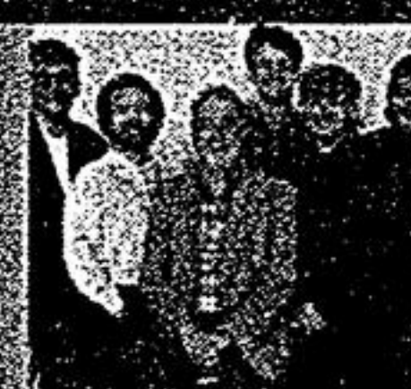
THE IRISH ROVERS Nov. 30, 2002