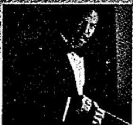
NATHANIEL DETT CHORALE Feb. 6, 2003