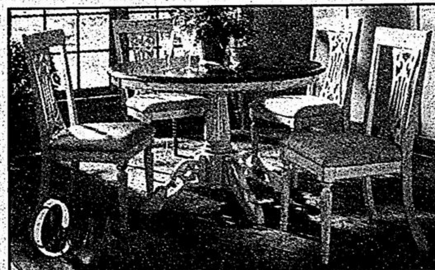
Table: Reg: 899. Sale $799 Chair: Reg: $225. Sale $199