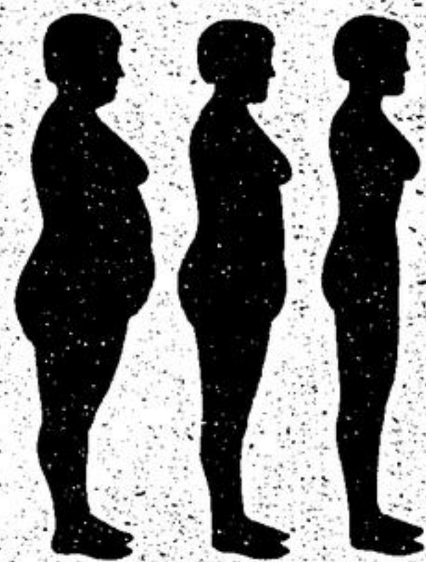
For men and women

YOU WILL SUCCEED with this herbal patch (pure clean ocean kelp bladderwrack) in combination with our healthy eating plan that lets you eat until you are full and still lose weight. No side effects. The patch makes men and women less hungry and the instructions show which foods make you lose weight without starving and which foods put on weight. In the stores below, ask for a FREE brochure THE EASY WAY TO LOSE WEIGHT PERMANENTLY, with more testimonials than any other product on the market. Many letters from delighted people with their full names and towns. Excerpts: "I feel proud & happy, lost 16 lbs. Paula Collins, Rochester, NY" "Losing 25 lbs raised my self-esteem." Tanya Thomas, Caledon, ON "Lost 24 lbs easily without starving; it really works. Alan Fuller, Regina, SK