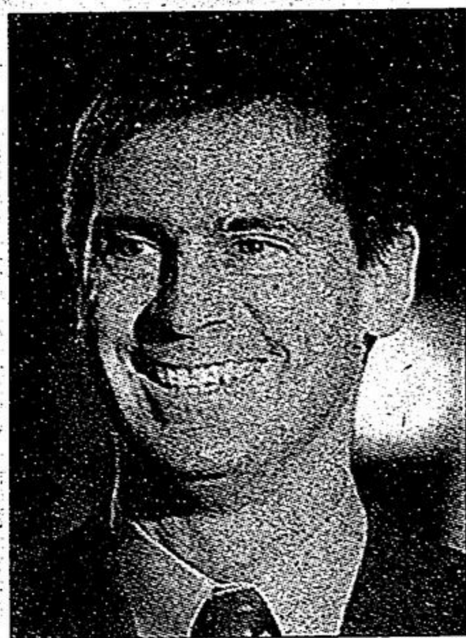
DALTON MCGUINTY: "I want all children schooled in values," says Ontario Liberal leader.

"No matter what your background, faith, culture or language, there are certain universal