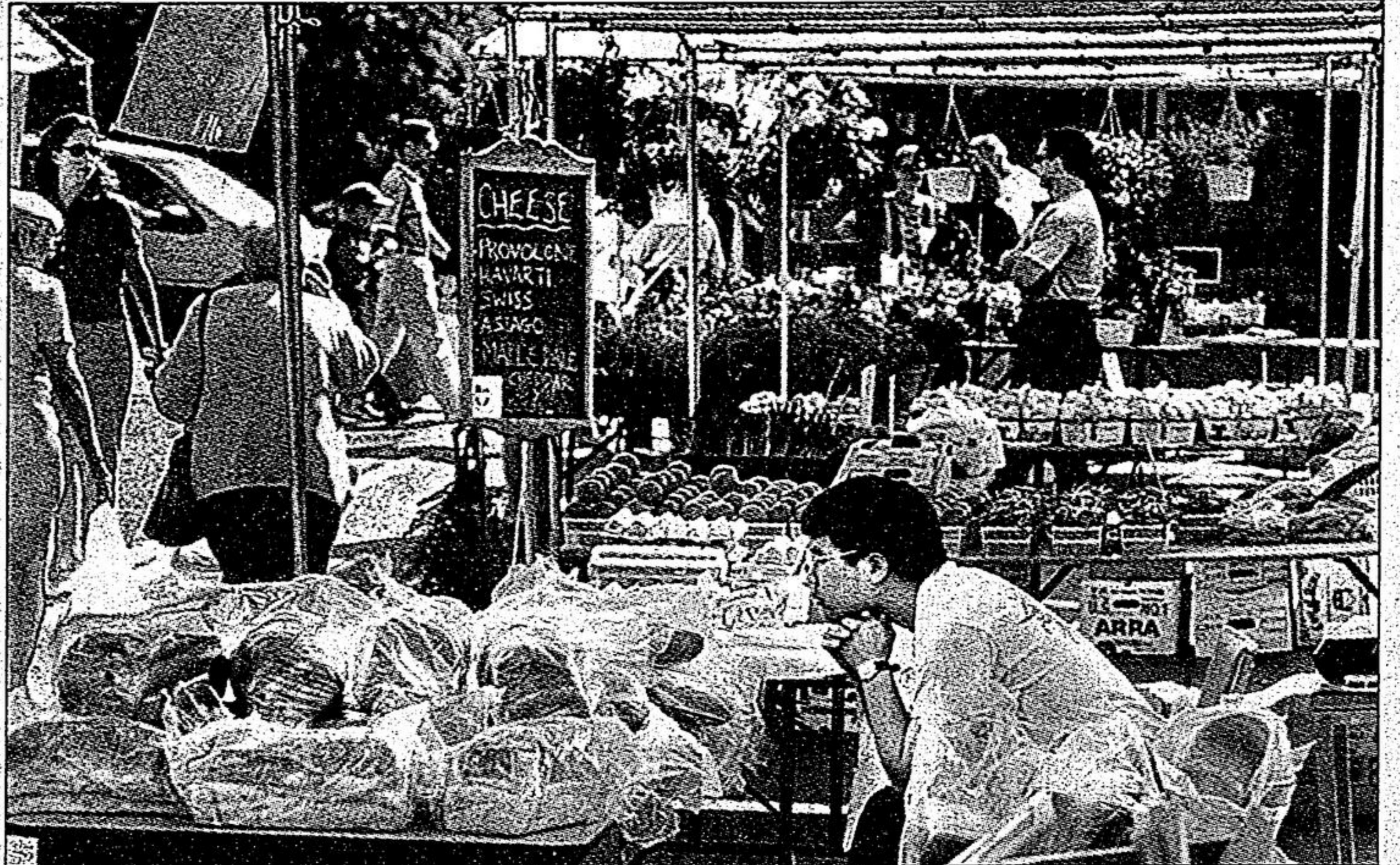
Bread, fruits, flowers and vegetables are among the items available at the Markham Farmers' Market, which is slated to open next weekend at Main and Robinson streets in Markham Village.

The market operates on Saturdays from 8 a.m. to 1 p.m.