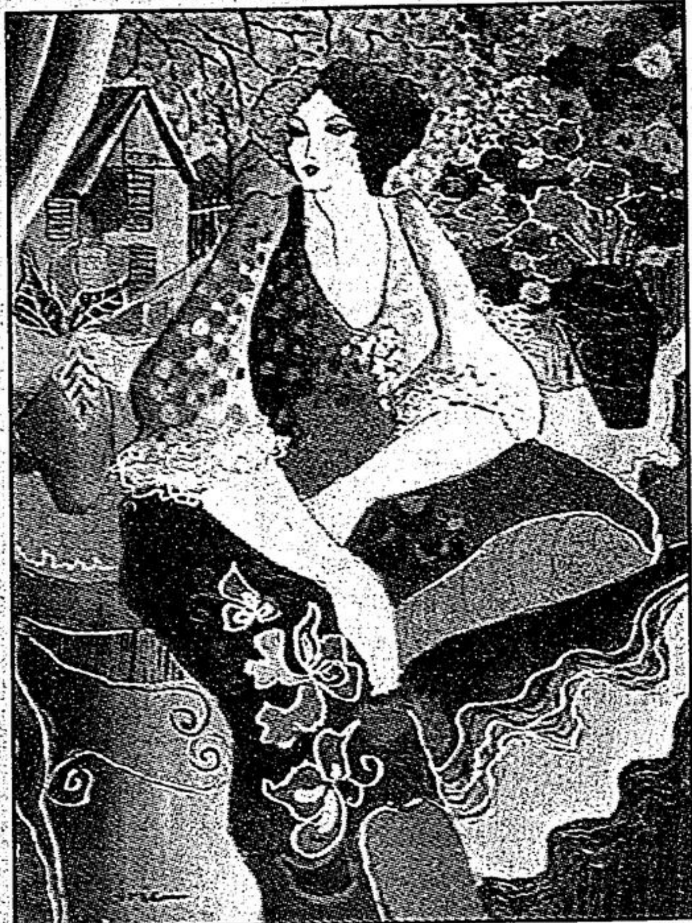
"Reflections" by Patricia

Police traffic teams will target high-collision areas in Community Safety Zones until May 7, issuing tickets and talking to drivers about impaired driving, speeding, safety at intersections, the dangers of drag racing, and safety in school zones and around school buses.