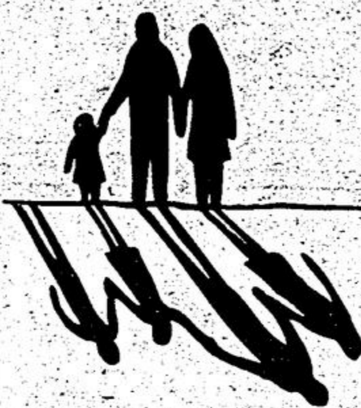
York Region An association of families who have lost a child through death.

For information, contact the Archer Academy at 905-726-2801.