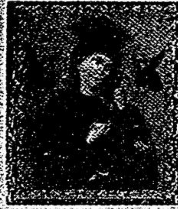
Our Mother of Perpetual Help