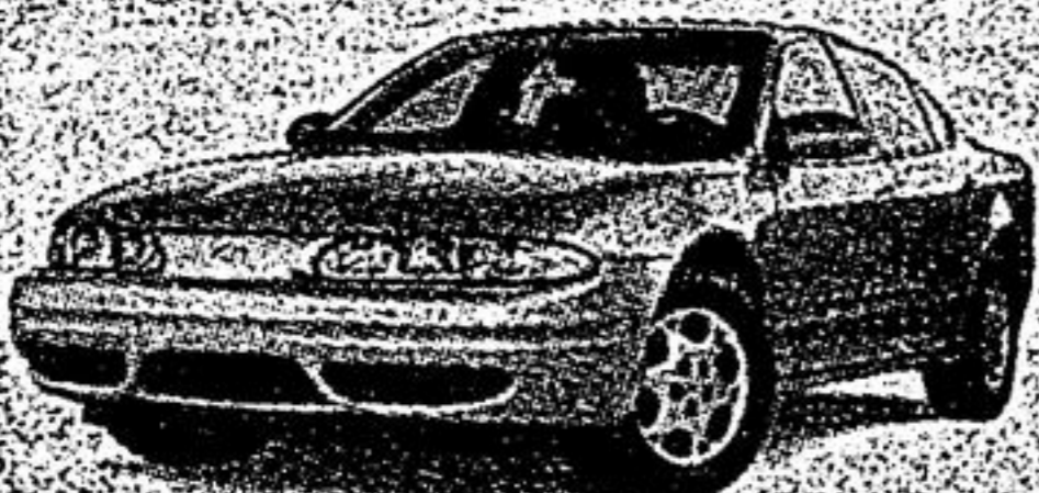
ALERO GX SEDAN BY OLDSMOBILE