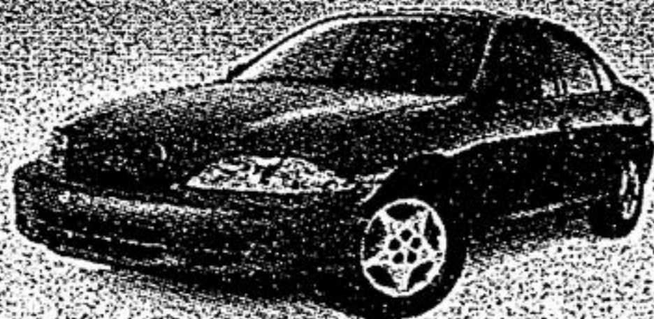
CHEVROLET CAVALIER VL COUPE OR SEDAN