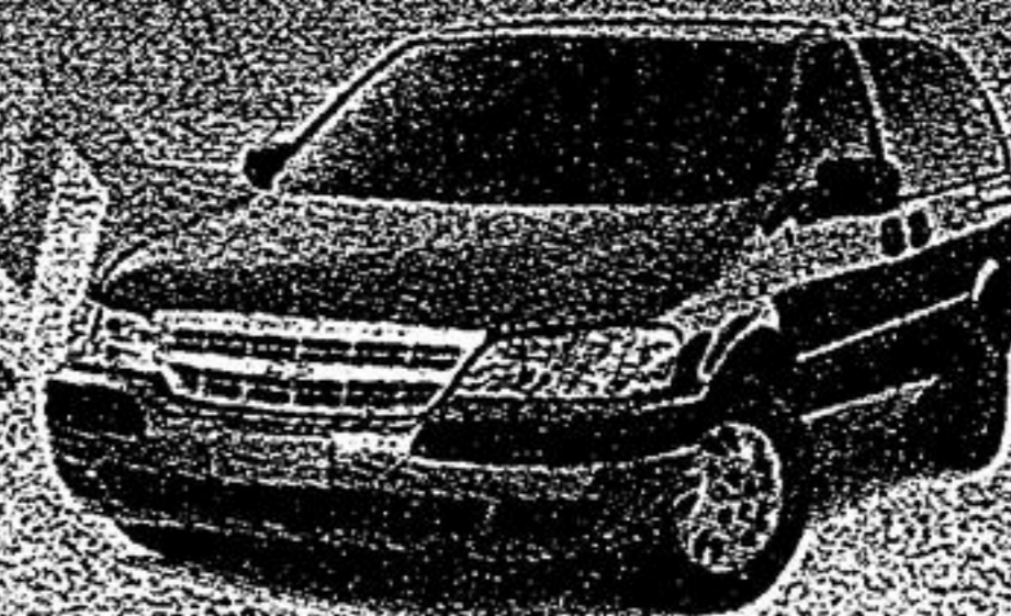
CHEVROLET VENTURE VALUE VAN