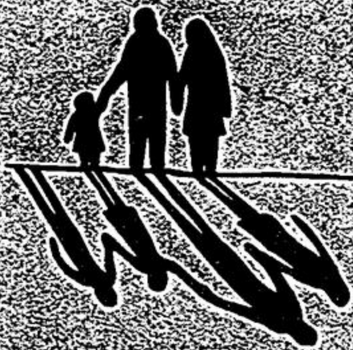
York Region An association of families who have lost a child through death.

This message brought to you as a community service of The Economist & Sun/Tribune