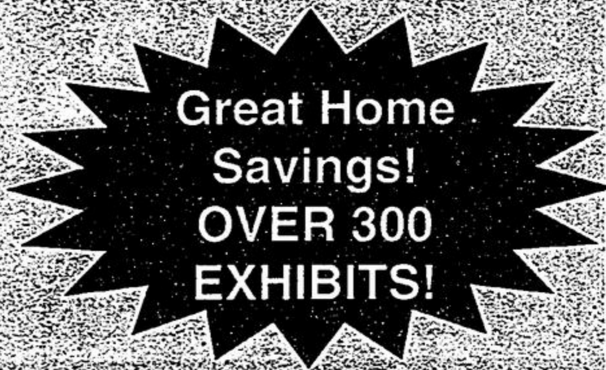
EXHIBIT SPACE STILL AVAILABLE CALL: 905-477-2677 x224

Look for more details in the coming weeks or visit www.nationalevent.com