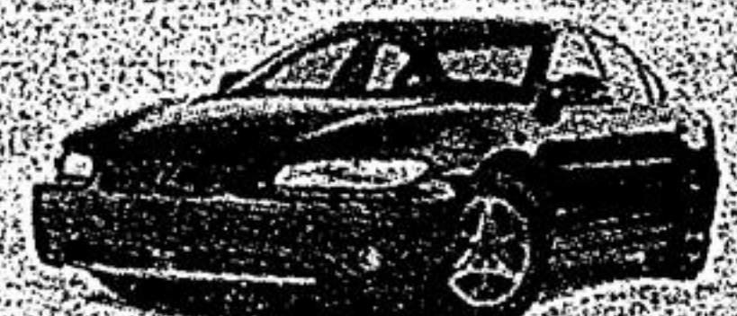
PONTIAC GRAND PRIX