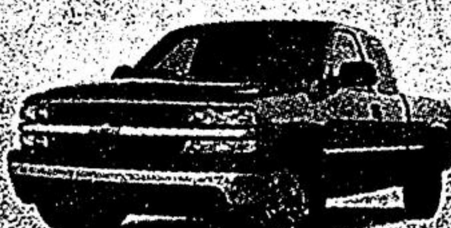
CHEVY SILVERADO EXTENDED CAB