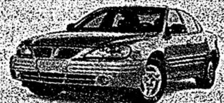
PONTIAC GRAND AM