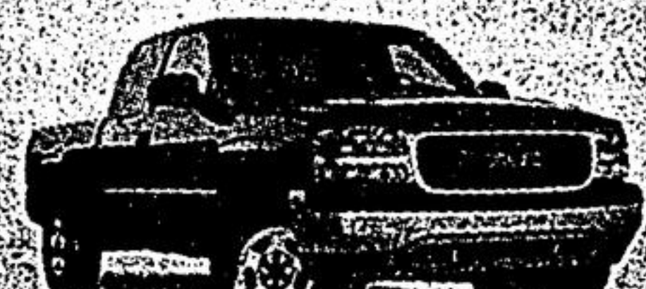
GMC SIERRA EXTENDED CAB

FOR A LIMITED TIME, ONLY AT YOUR LOCAL CHEVROLET • OLDSMOBILE & PONTIAC • BUICK • GMC DEALERS.