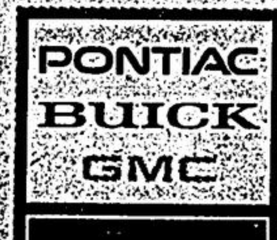
PONTIAC BUICK GMC