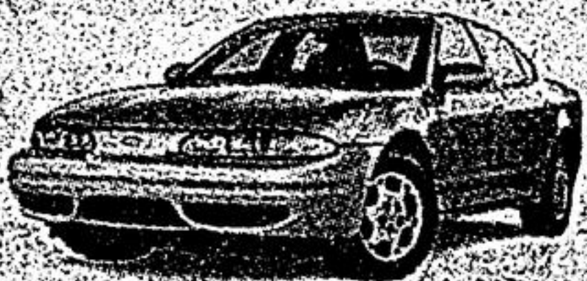
ALERO BY OLDSMOBILE