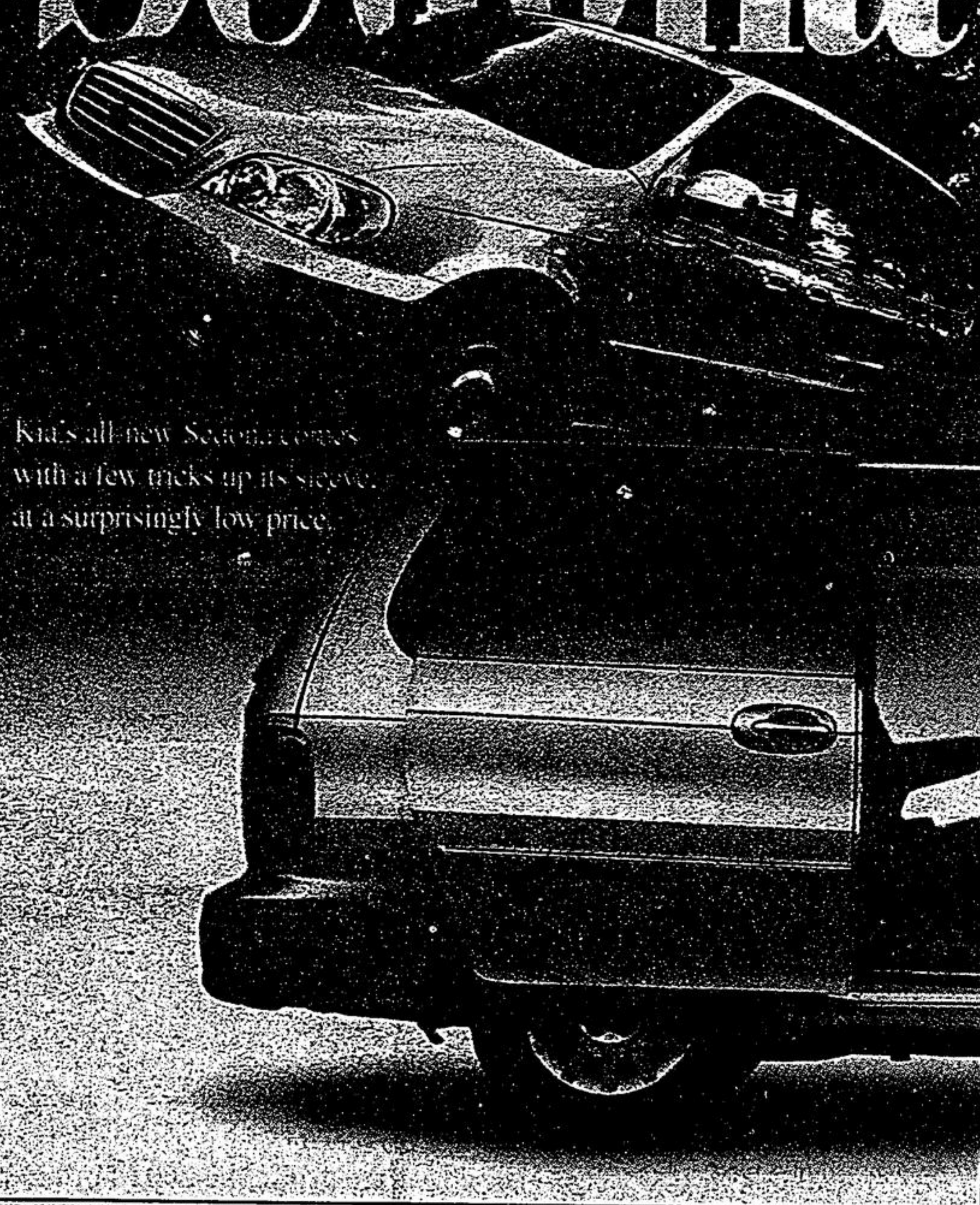
Kia's all-new Sedona comes with a few tricks up its sleeve, at a surprisingly low price.