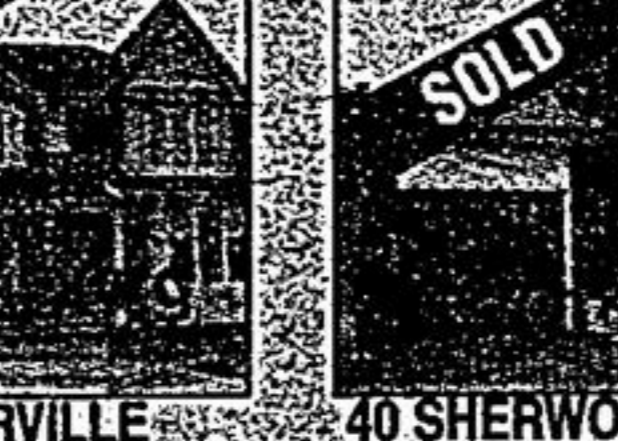
40 SHERWOOD FOREST

PUT YOUR NAME ON MY LIST OF SATISFIED CUSTOMERS! For results and an honest evaluation call Anne Cairns* at 905-940-4180