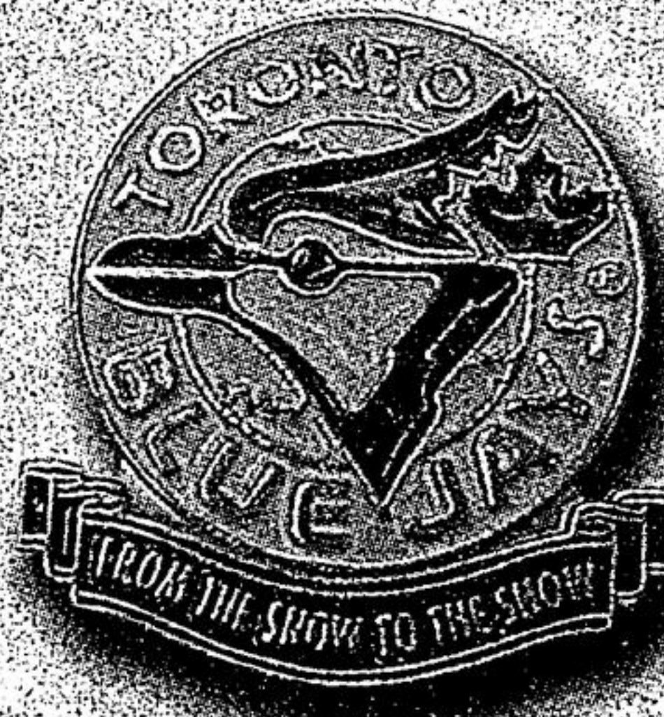
Wednesday, May 23 From the Snow to the Show Pin #2