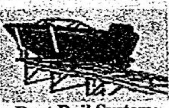
Boat Rail System