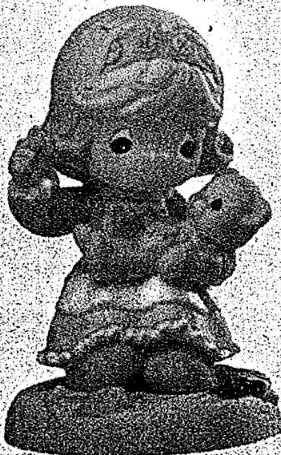
"You Have The Beary Best Heart" $50.00 SRP 730254