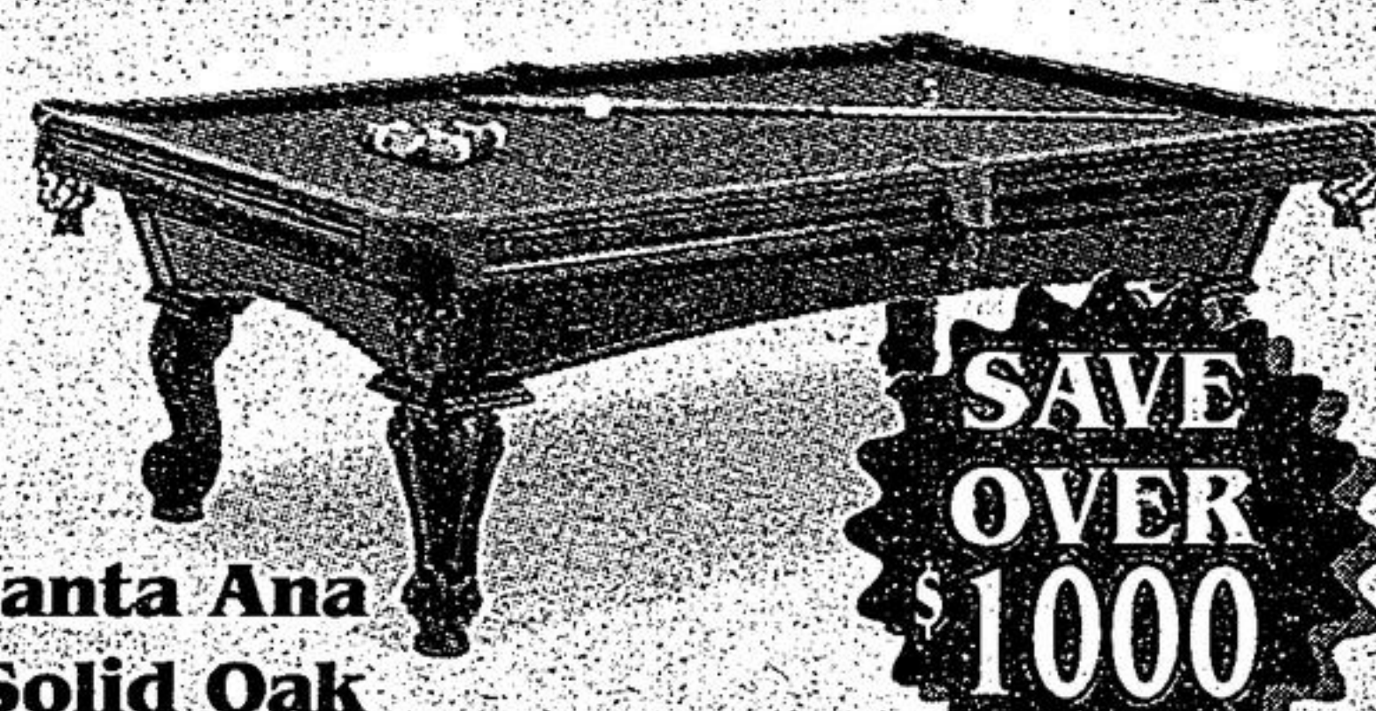
Santa Ana Solid Oak