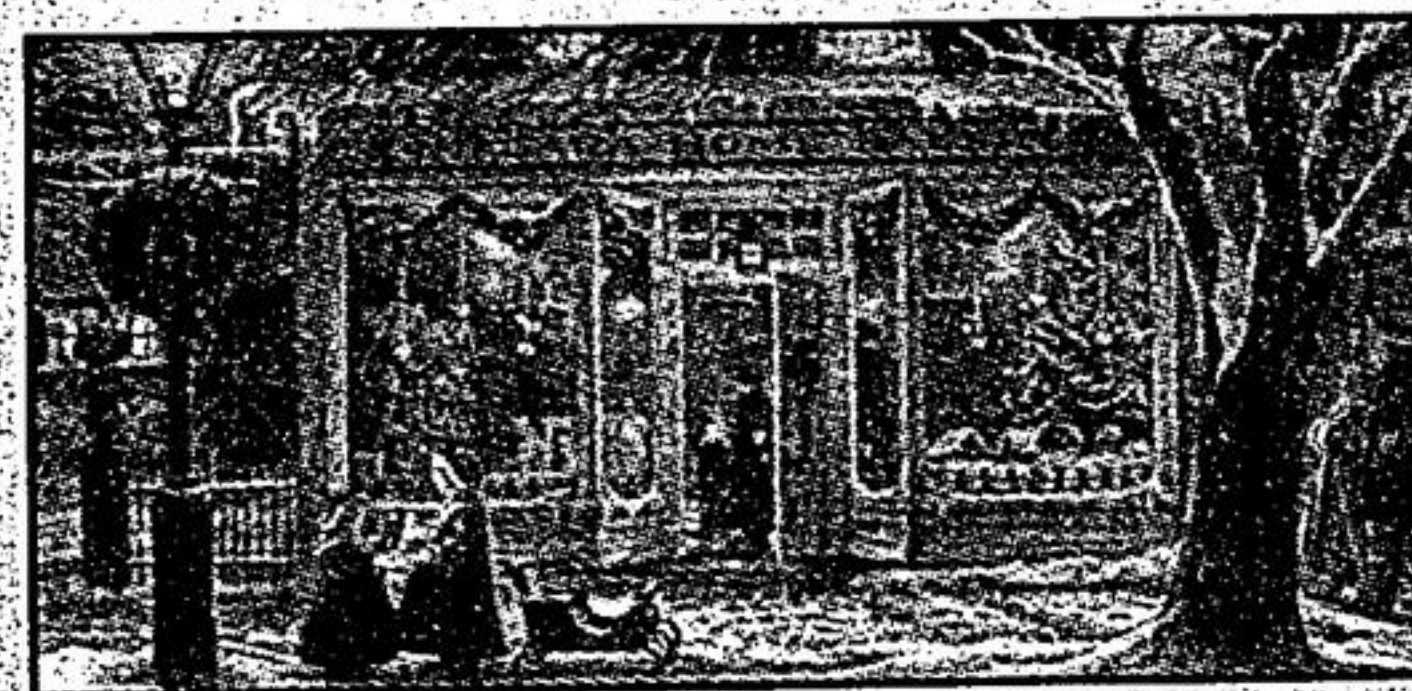
$340.00 "The Home Bakery" 12"x17, 1/4" Image

YES, WE ARE CLOSING DOWN Rock Bottom Prices. Everything Must Go. No Reasonable Price Refused