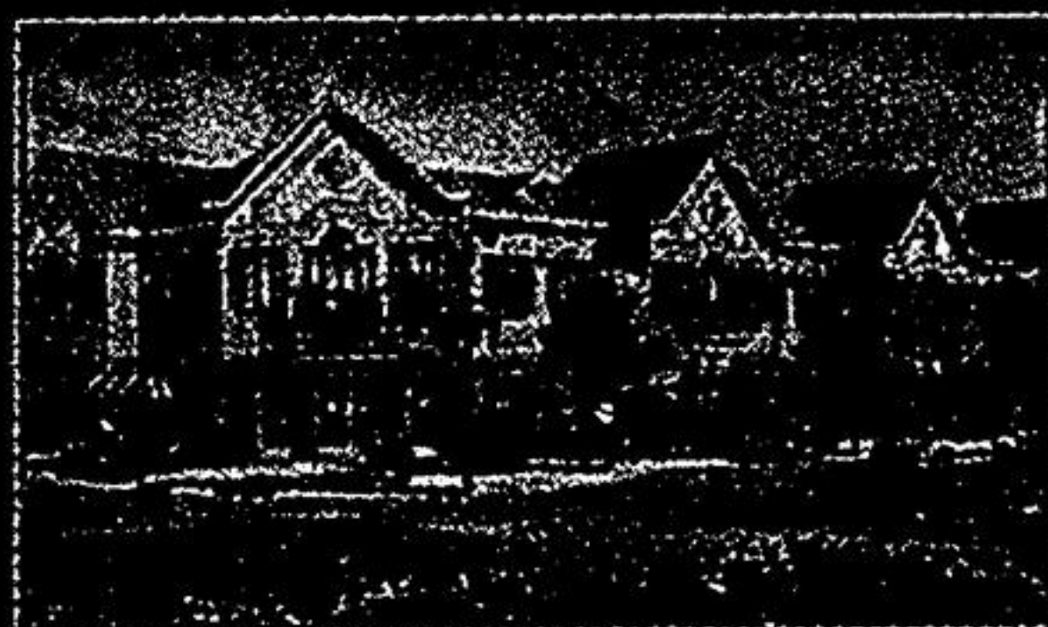
The Sims design award winner