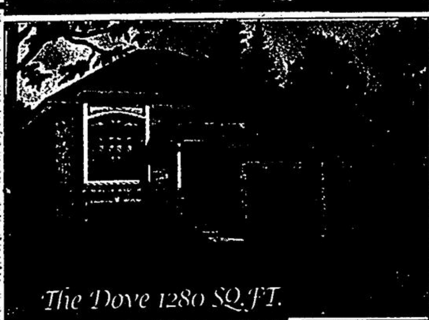
The Dove 1280 SQ. FT.

Live where the good things in life never change.