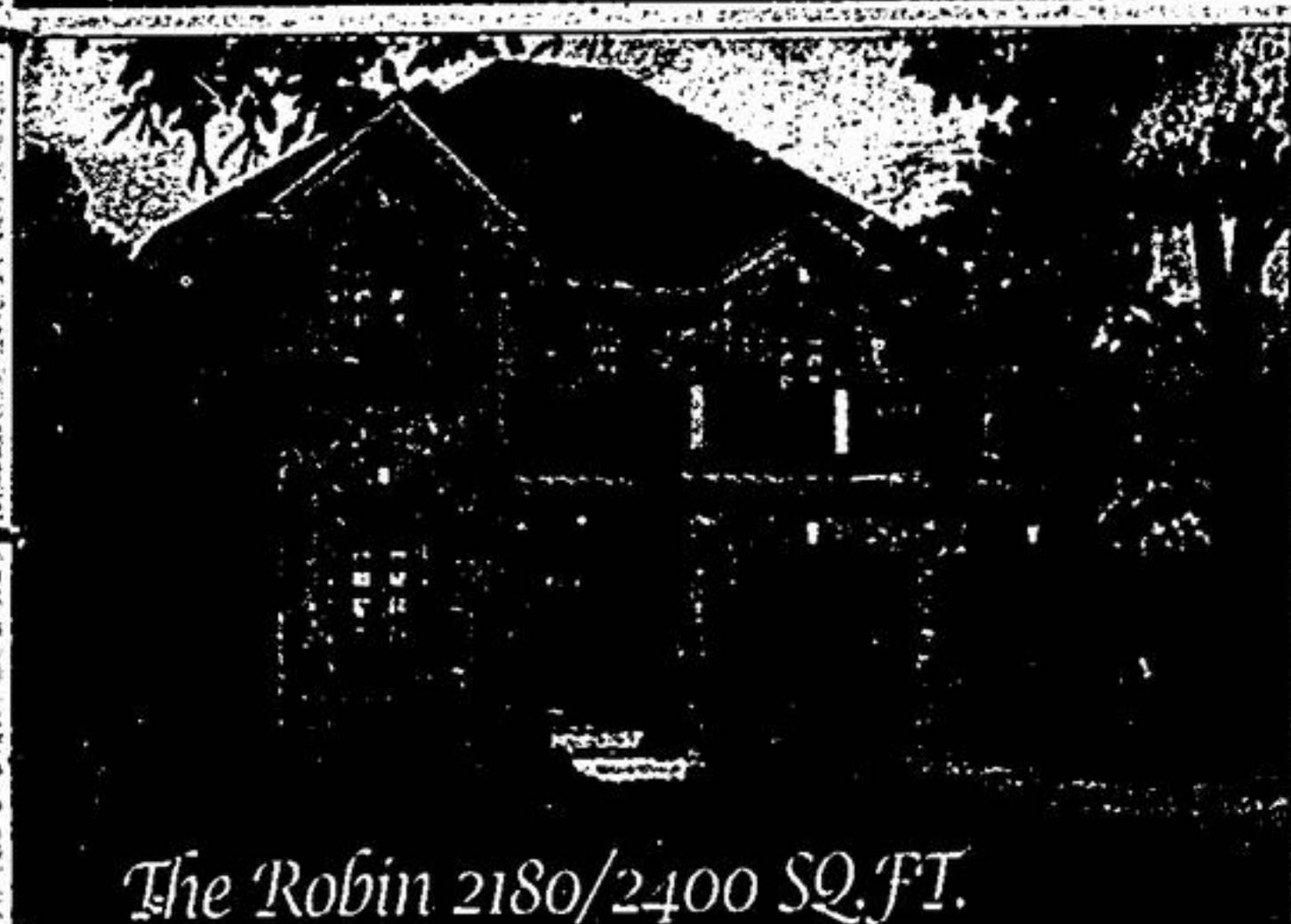
The Robin 2180/2400 SQ. FT.