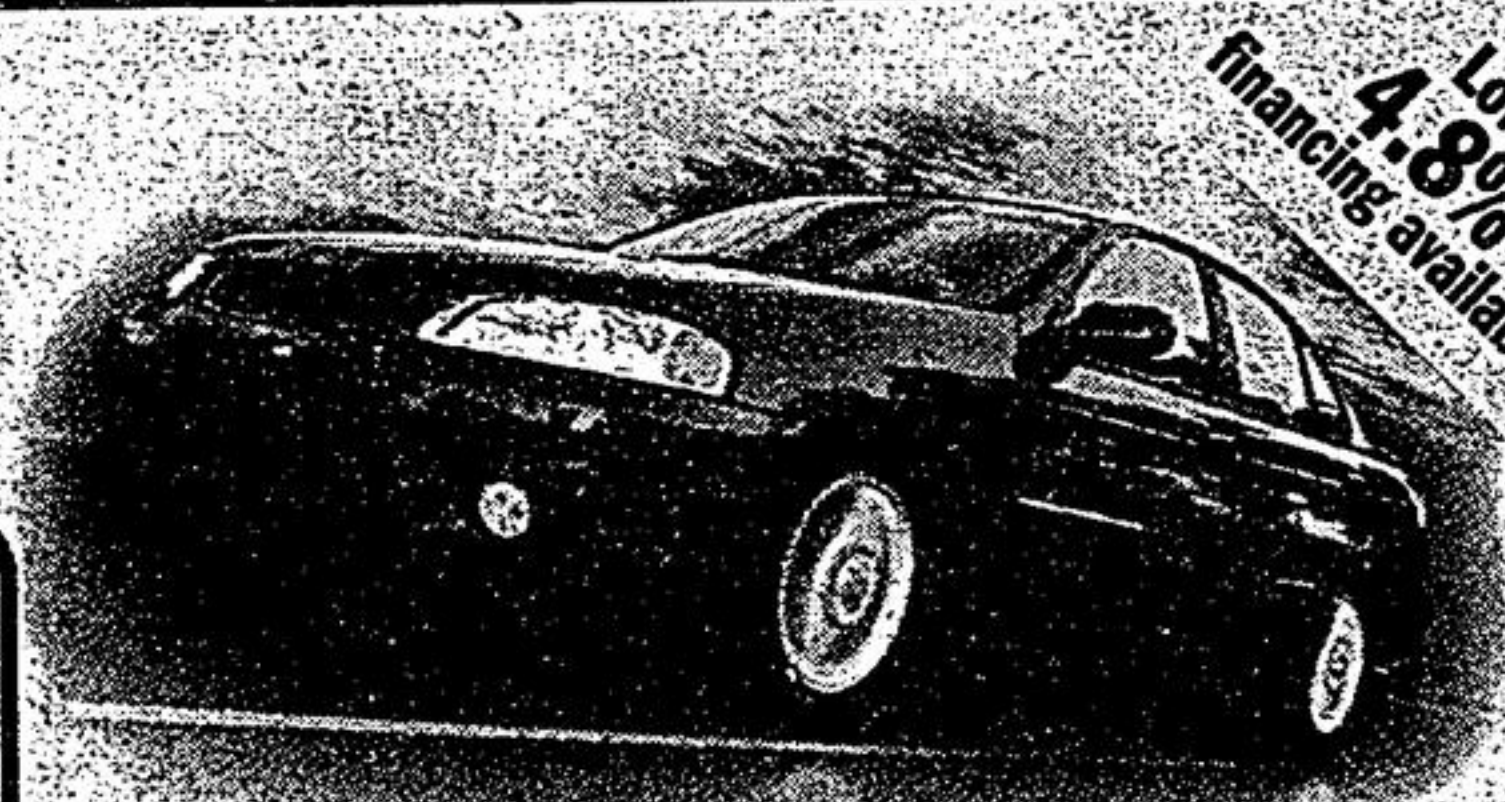
Sentra XE starts at $15,298

Purchase Sentra XE with Value Option Package for only $16,398 OR Lease Sentra XE with Value Option Package for only $198/mo. for 48 months, only $1,632 down.