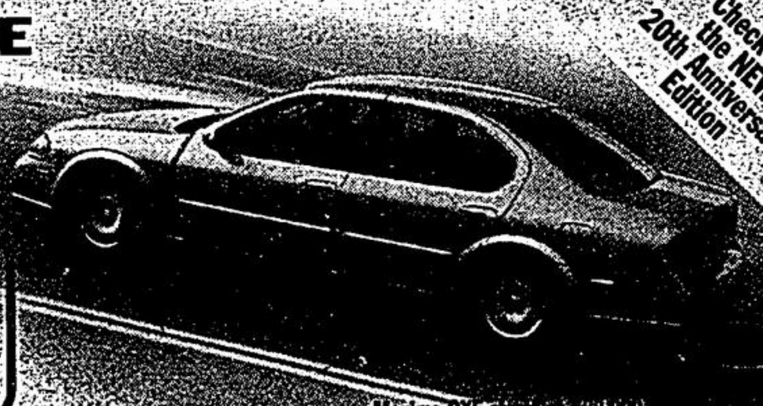
Maxima GXE starts at $24,000

Purchase Maxima GXE with Convenience Package for only $32,100 OR Lease Maxima GXE with Convenience Package for only $368/mo. for 48 months, only $4,650 down.