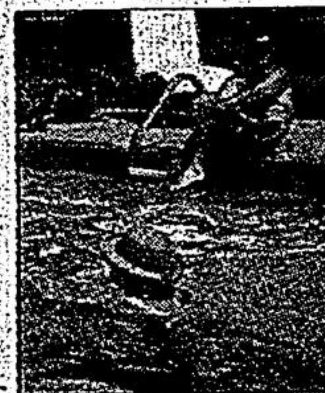
Three swimming pools.

house for the exclusive use of the residents of Swan Lake Village.