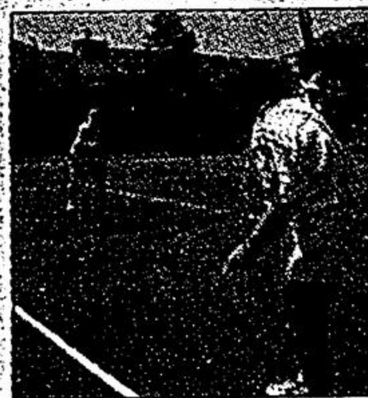
Four tennis courts.

Presenting you with 24-hour gated security and professional on-site property management.