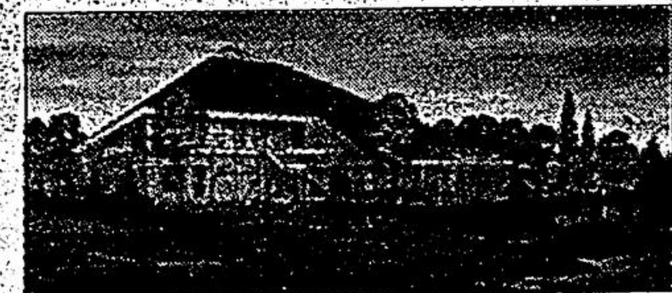
A residents' only club house

Now you can have a new beginning that comes with a distinctive Ambiance.