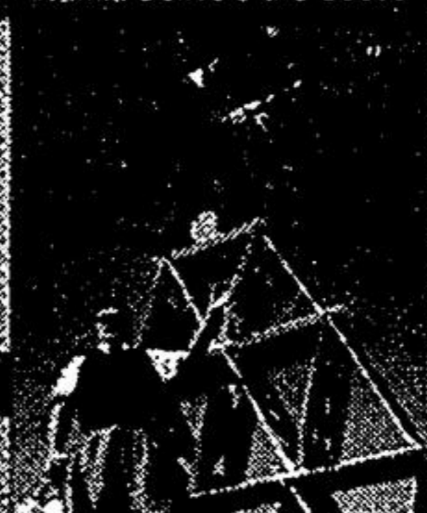
Smythe & Saucier