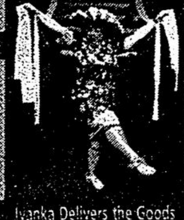
Ivanka Delivers the Goods