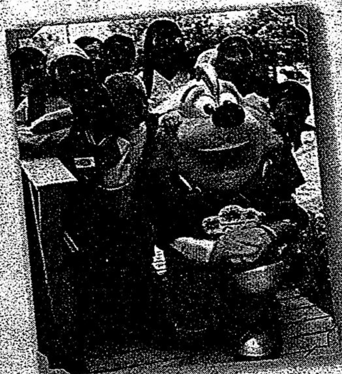
Millennium Mark and friends at the Peace Garden built at Johnsonview Public School.