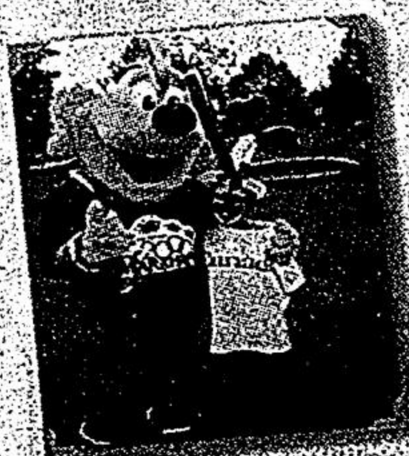
Millennium Mark, the official mascot of Markham 2000, appeared at many community events, including the Canada Day celebrations.