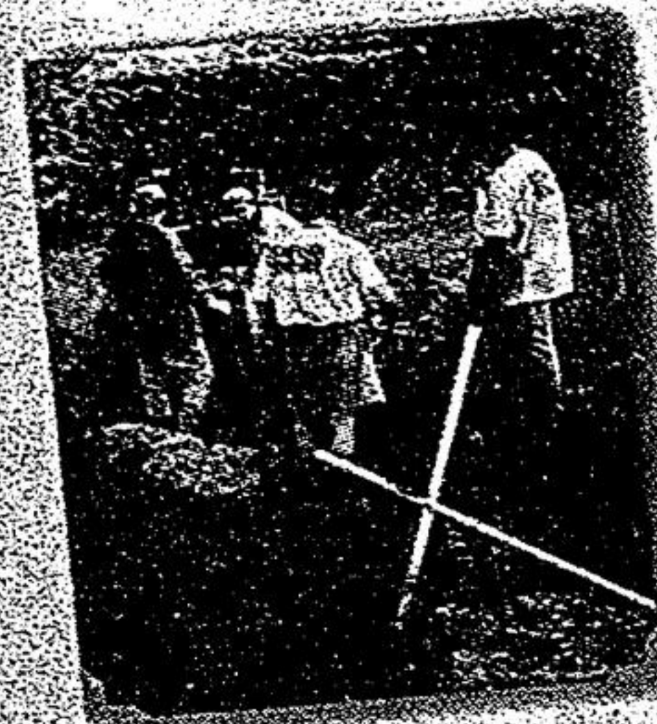
Restoration of a fragile wood lot behind Reesor Public School.