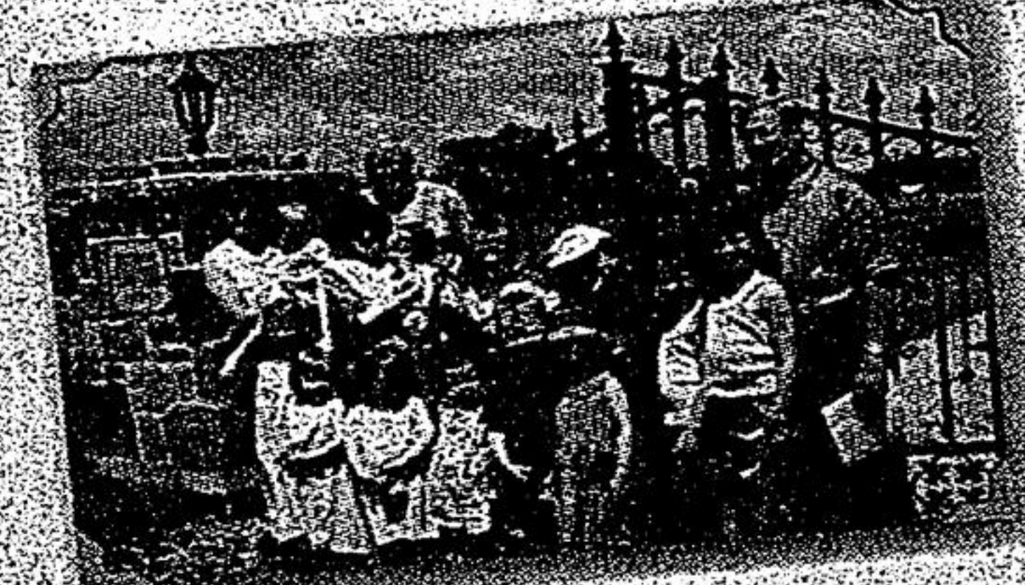
New gateway at Reesor Pioneer Cemetery.