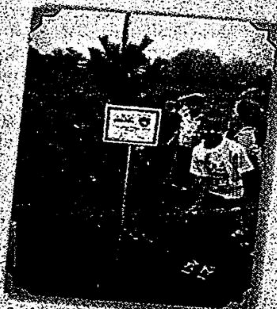
Students at Flowerdale Public School helped plant six White pine trees - one for each grade at the school.

Markham 2000 supported 50 projects that qualified for a total of $550,000. The funding was provided by the Town and the Markham 2000 committee, which raised money through advertising and sponsorship.