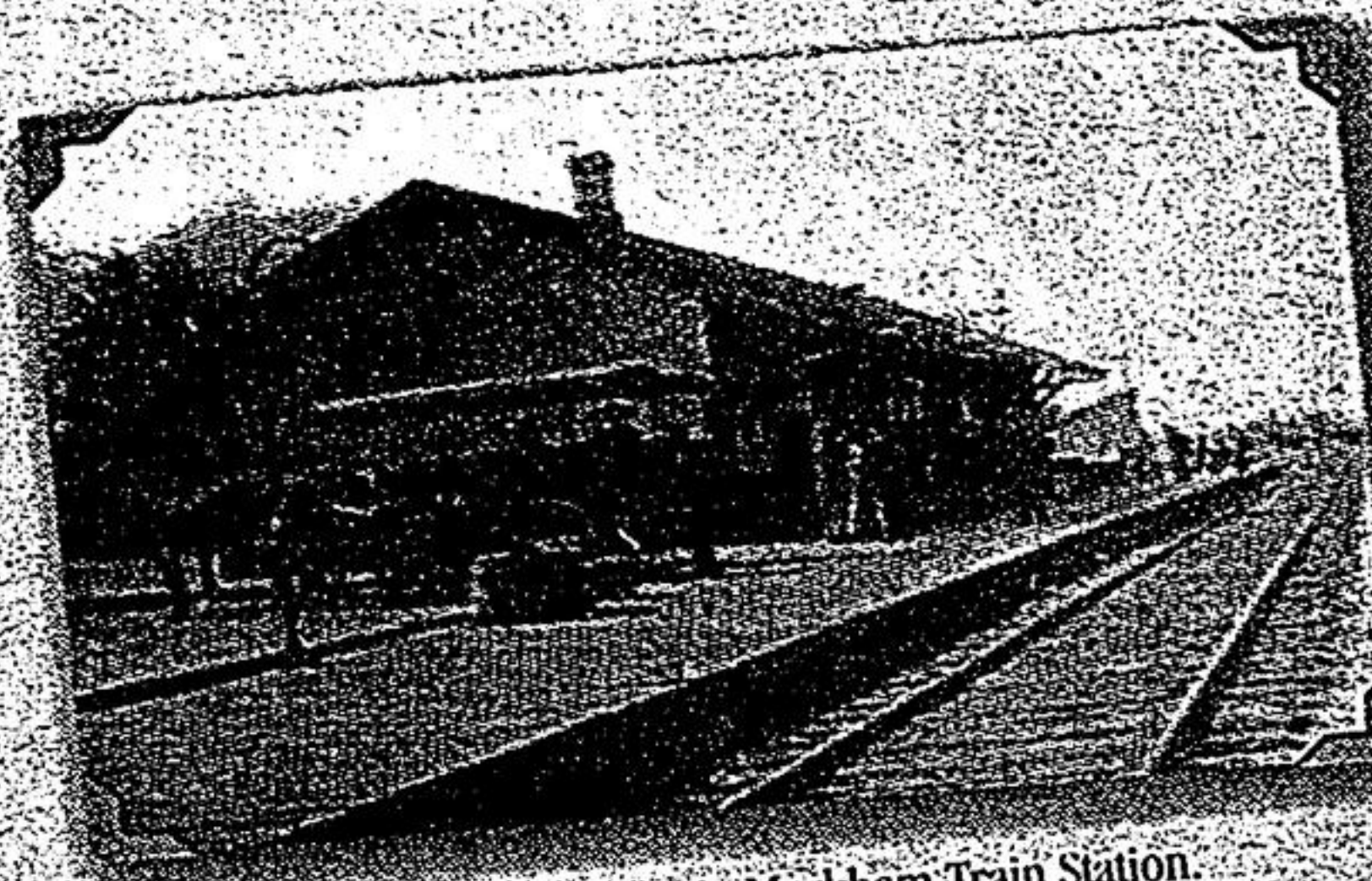
Restoration of the historic Markham Train Station.

BIRD BATH; JOHNSONVIEW PUBLIC SCHOOL PEACE GARDEN; MILLENNIUM SCHOOL PROJECT; REESOR PARK PUBLIC SCHOOL WOODLOT RESTORATION; ST. EDWARDS CATHOLIC SCHOOL TREE PLANTING; ST. MONICA CATHOLIC SCHOOL BUTTERFLY GARDEN; WILLIAM ARMSTRONG PUBLIC SCHOOL PLAYGROUND AND TREE PLANTING; WILLIAM BENNY PUBLIC SCHOOL TREE PLANTING HISTORY; GATEWAY TO REESOR PIONEER CEMETERY; HEINTZMAN HOUSE EMPIRE LOYALIST DESIGNATION; HEINTZMAN HOUSE PAINTINGS