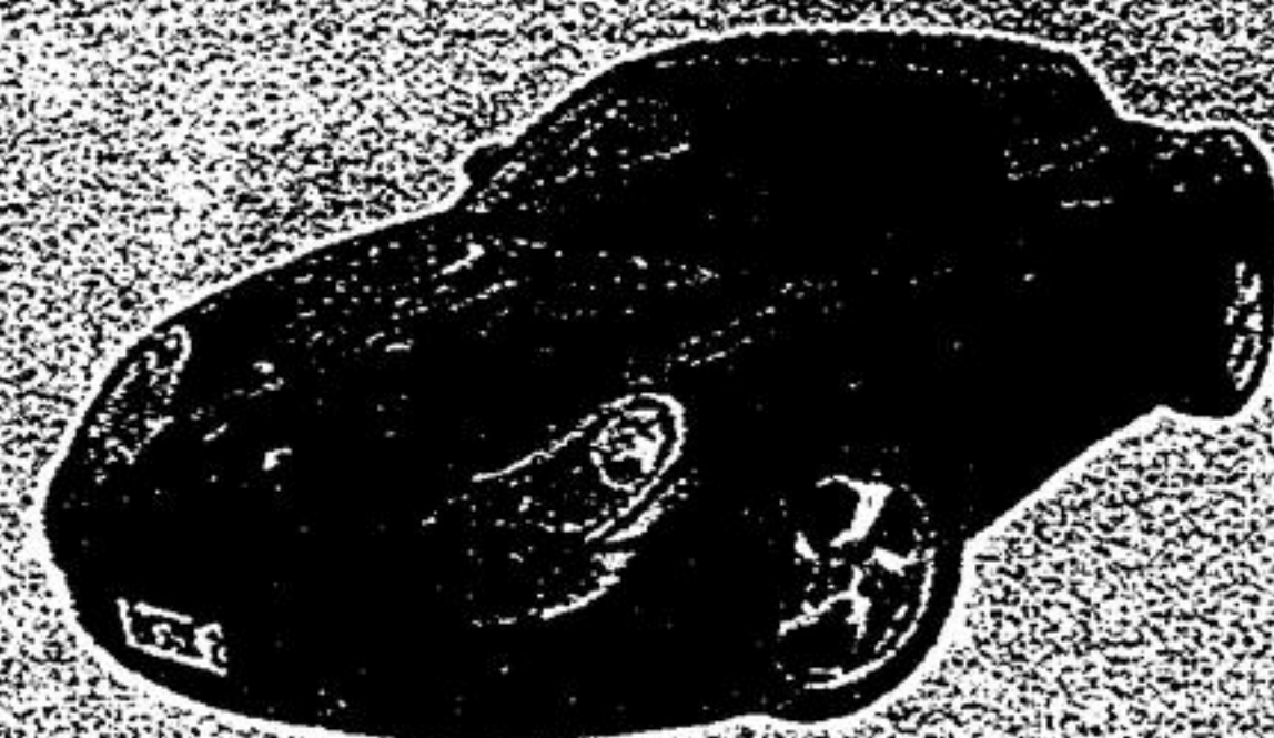
BOXSTER S [ PAGES 15 & 16 ]