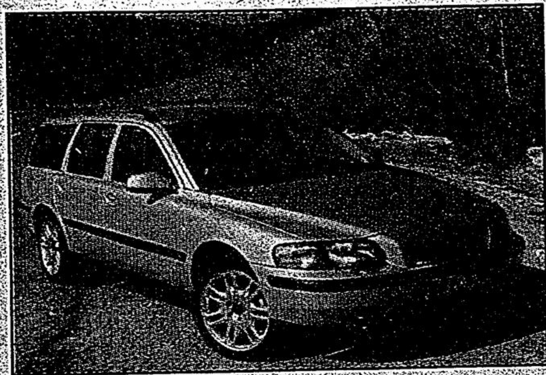
The family resemblance between the big S80 Volvo sedan and this new 2001 V70 Wagon is intentional and shows off the new "family" styling the Swede now sports.

Volvo has certainly changed in the past 10 years. Once the bastion of the square-sided sedan and wagon, Volvo today is turning out truly great look cars like the C70 Coupe and the new 40-Series coming this fall. But underneath the sexy skin, safety and honest construction remain Volvo virtues and one of the reasons why new owner Ford has wisely offered to share money and resources, but has not made interference part of the bargain.