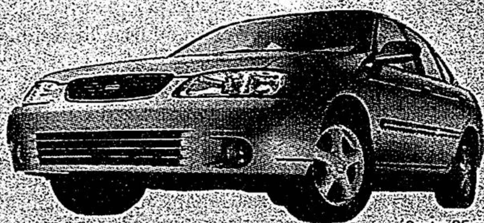
Sentra SE model shown