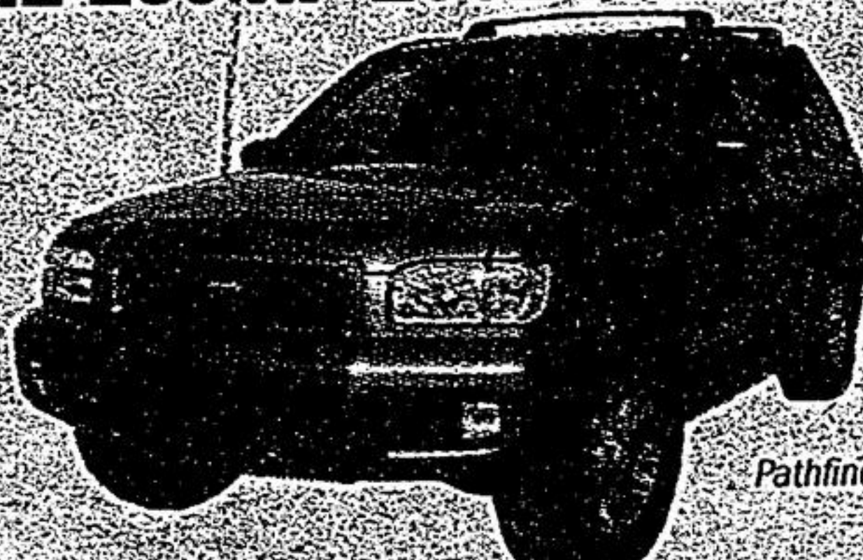
Pathfinder LE model shown