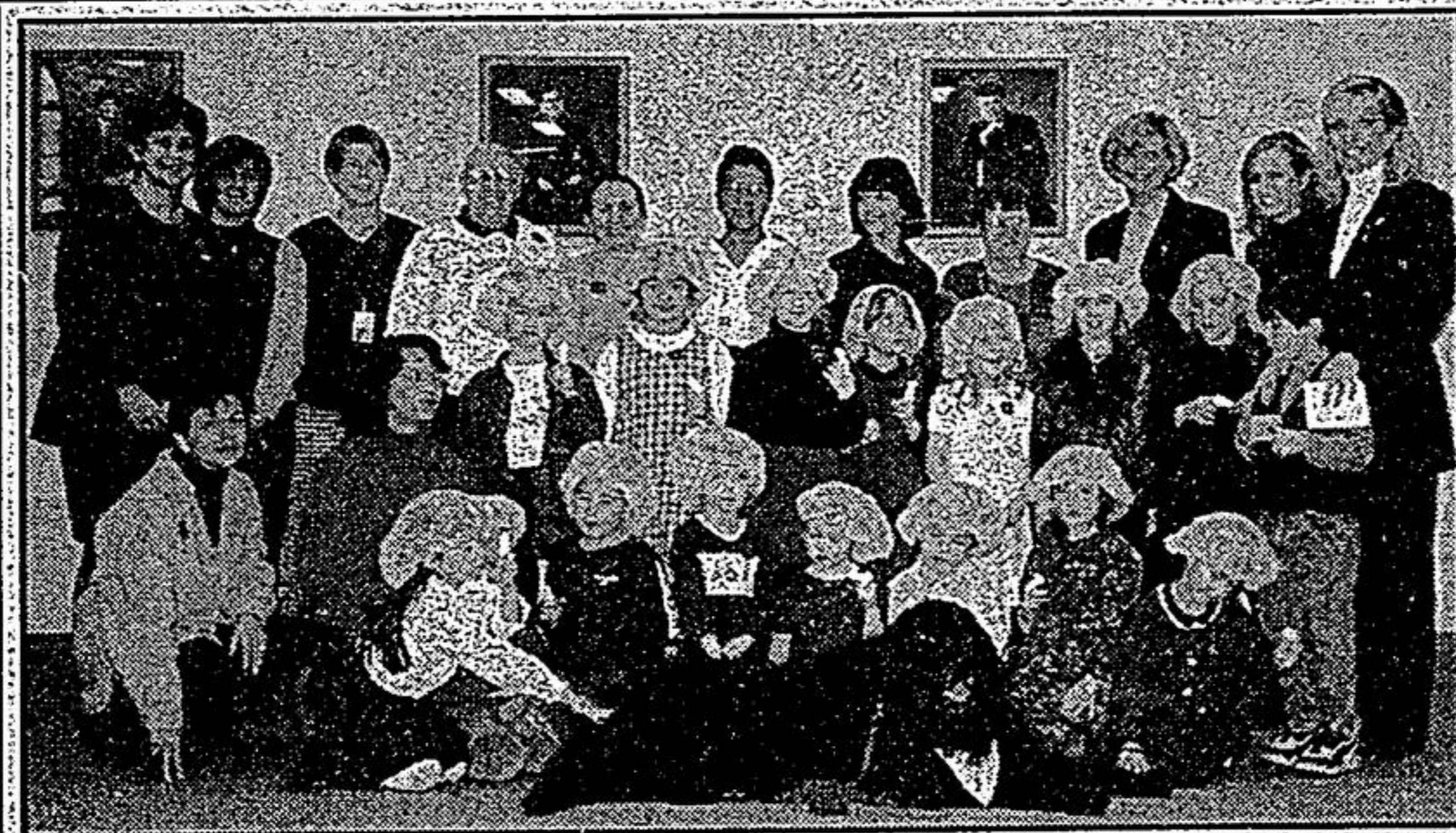
A class of students and parents from the Montessori North School enjoy their tour of the Markham Stouffville Hospital. The tours are conducted by volunteers every Thursday of the school year. Teddy Bear a St. John Ambulance trained dog joined the class for this tour.