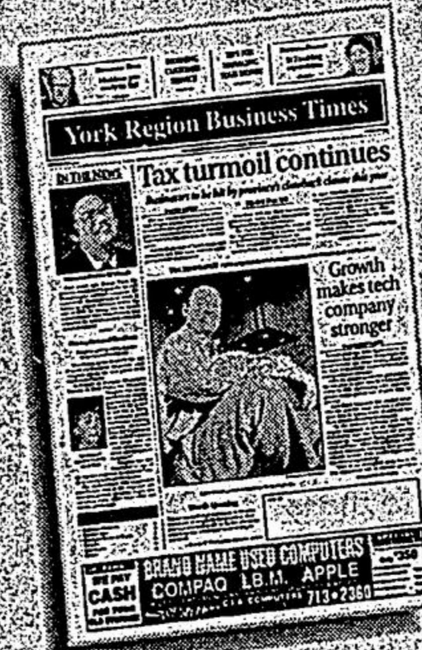
York Region Business Times

Just call, and we'll take care of the details – like copywriting and graphic design – and put together a program that will help build your sales in the new millennium.