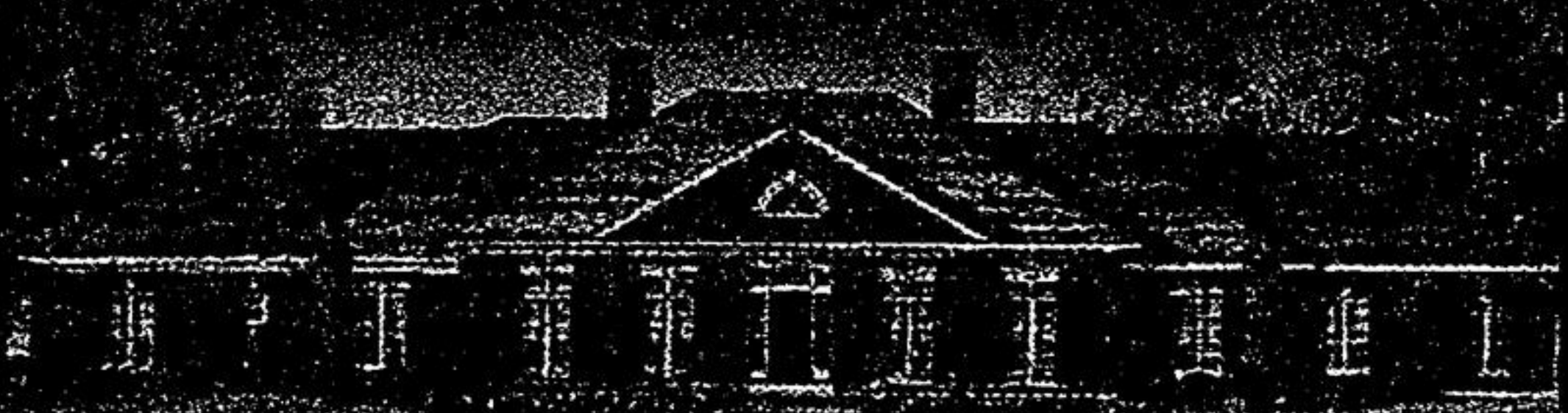
The Havellam, 5,735 sq. ft. for $1,095,000

CLASSICALLY STYLED GEORGIAN BUNGALOW, FEATURING 4 LARGE BEDROOMS, A GORGEOUS GREAT ROOM AND LIBRARY LIT BY AN EBONY WOODBURNING FIREPLACE, GOURMET KITCHEN, WALK-OUT LOWER LEVEL AND A WHOLE HOST OF SOPHISTICATED ARCHITECTURAL TOUCHES.