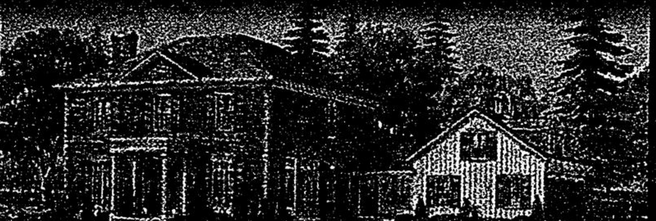
The Summerhill, 3,050 sq. ft. for $829,000

CLASSICALLY STYLED GEORGIAN BUNGALOW, FEATURING 4 LARGE BEDROOMS, A GORGEOUS GREAT ROOM AND LIBRARY LIT BY AN EBONY WOODBURNING FIREPLACE, GOURMET KITCHEN, WALK-OUT LOWER LEVEL AND A WHOLE HOST OF SOPHISTICATED ARCHITECTURAL TOUCHES.