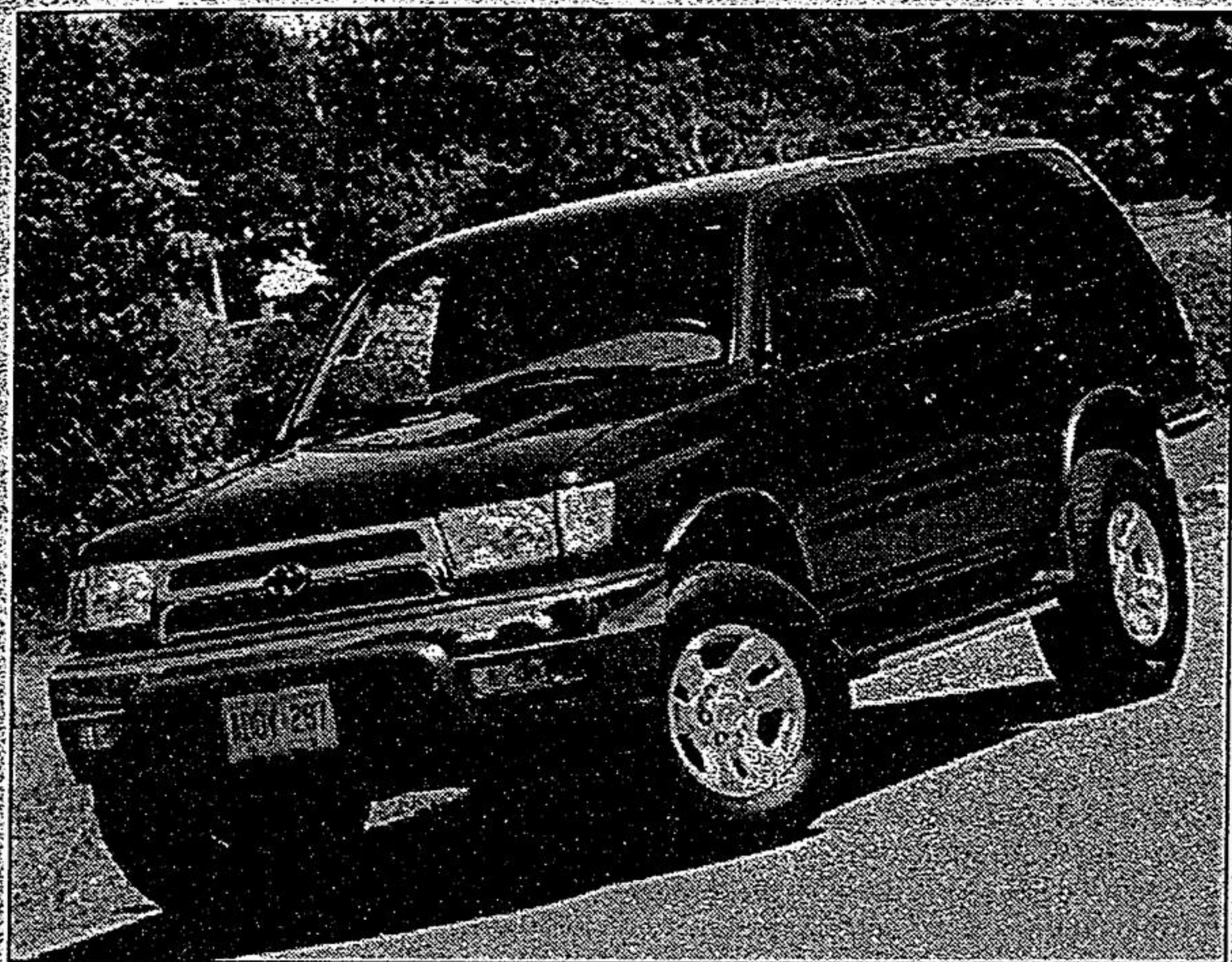
The 4Runner offers real off-road ability.

Experience a feeling of snug solidity with the 4Runner