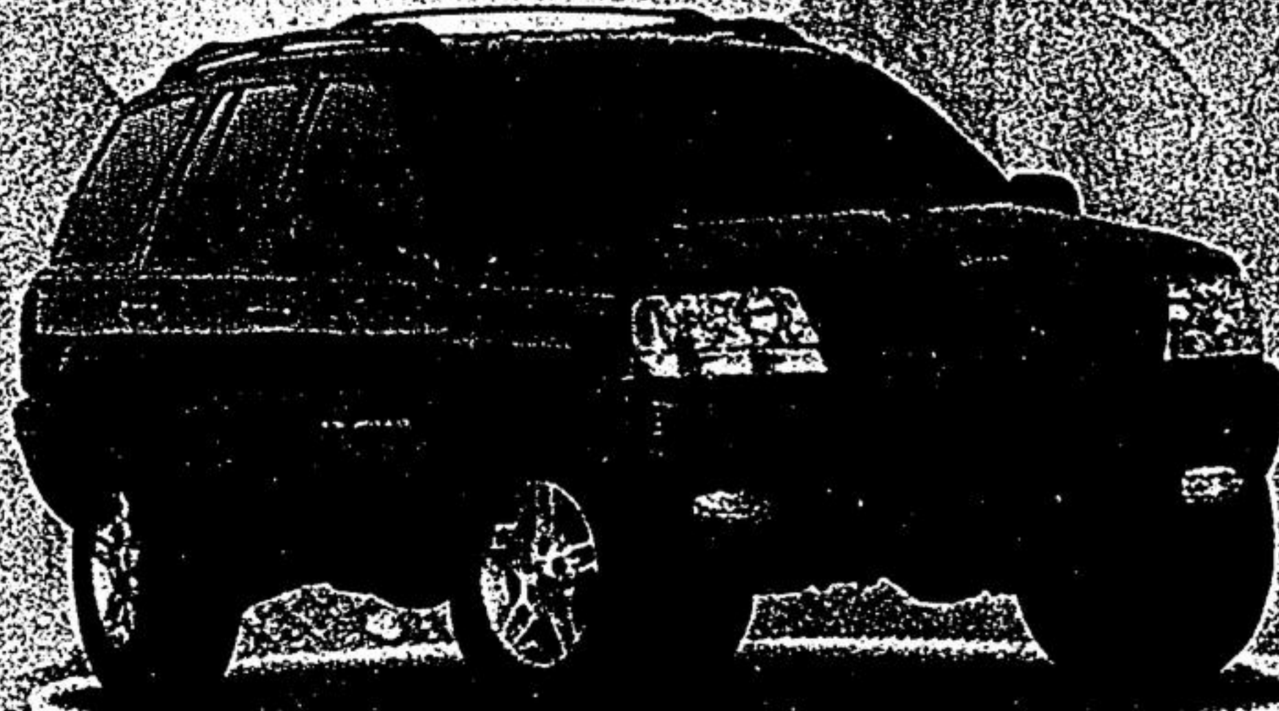
GRAND CHEROKEE LIMITED